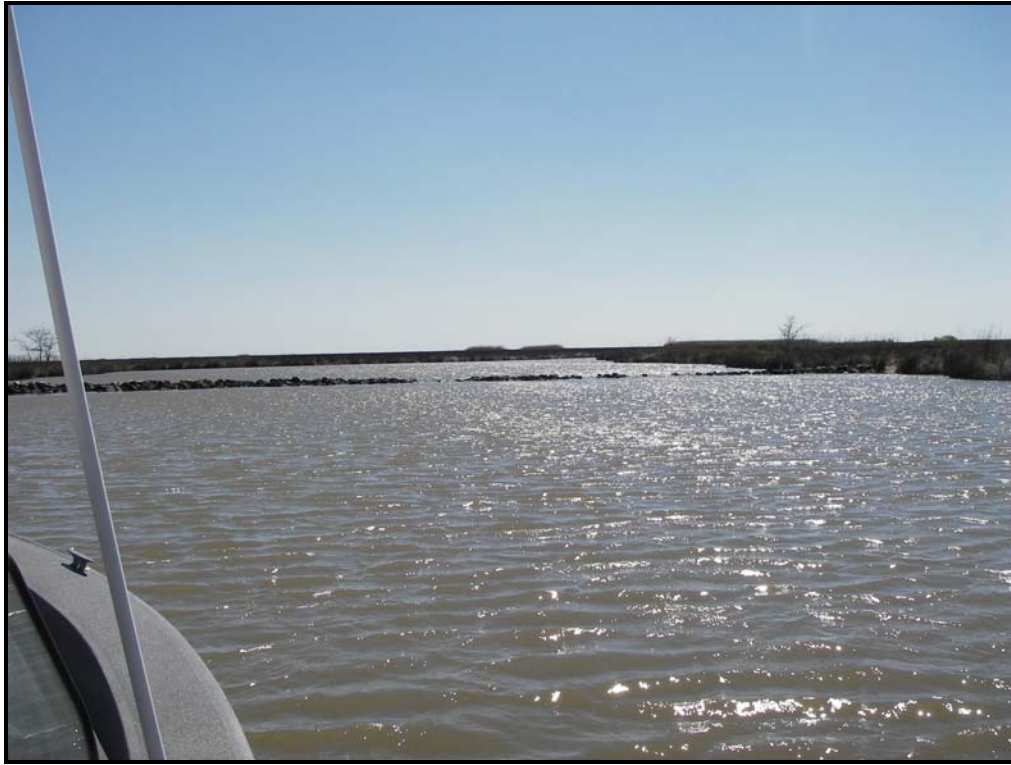
Photo 1, Closure No.1, Note low areas of stone in center of structure.