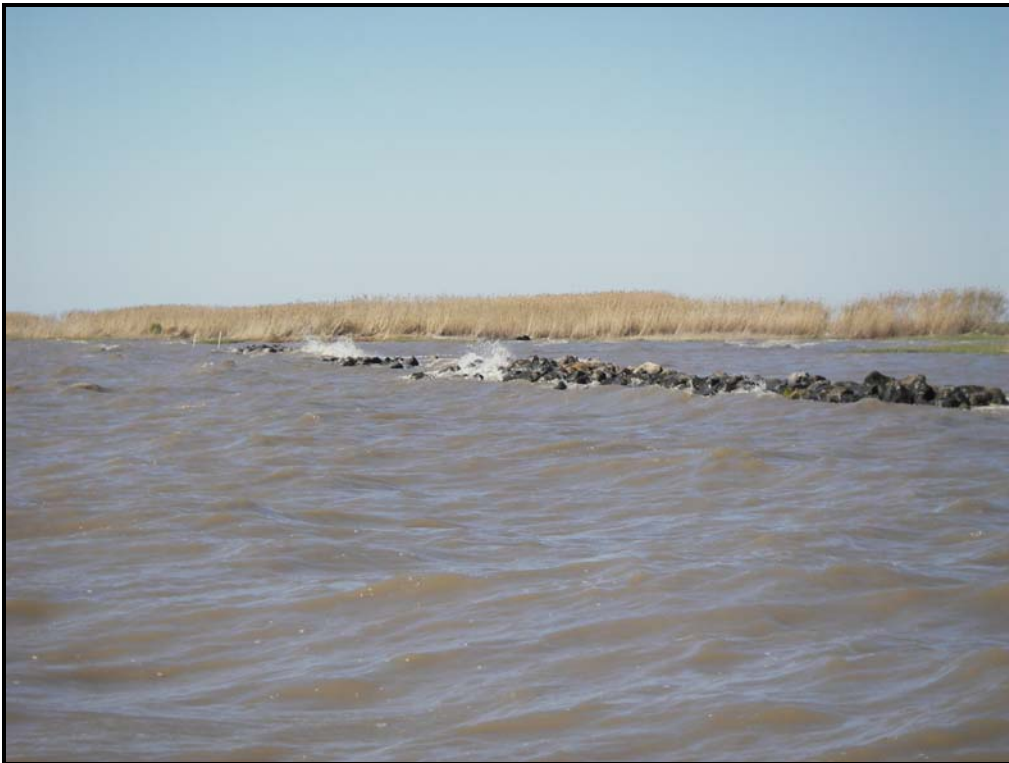
Photo 10, Closure No. 9, Along south shore of Marsh Island. Note that shoreline protection dike is now away from the current shoreline post-RITA.