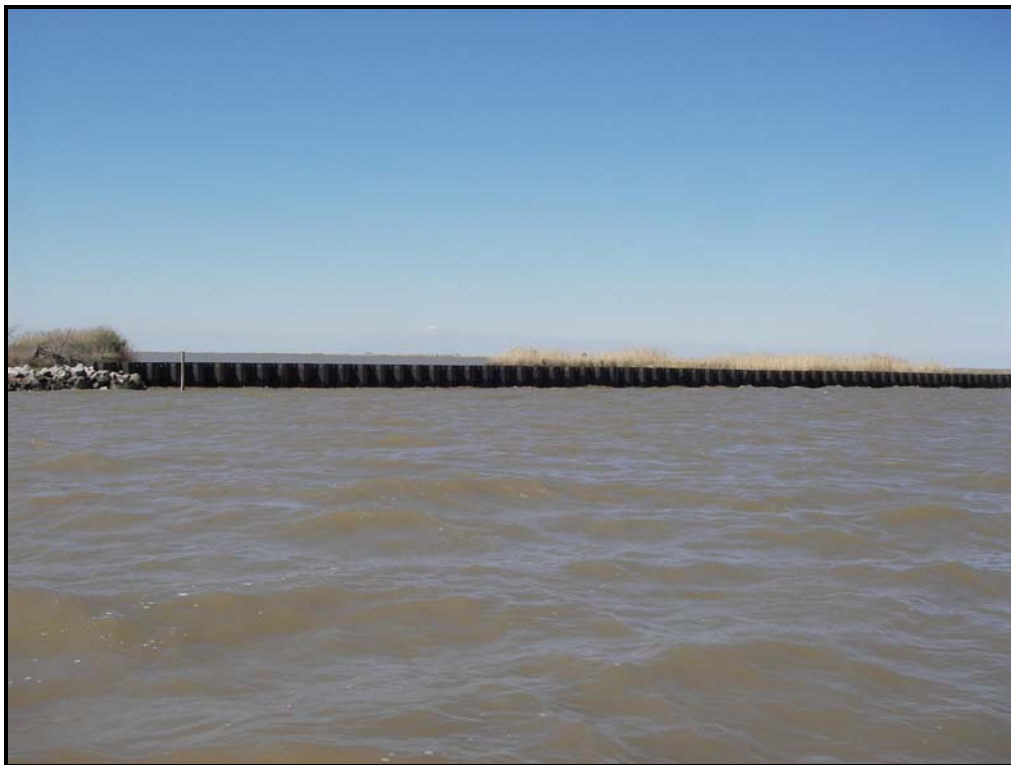
Photo 6, Closure No. 5. View of center portion of structure showing sheet pile wall.