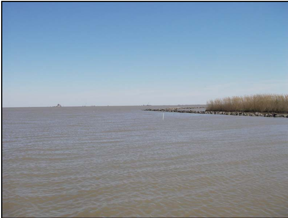
Photo 4, Closure No. 3, View looking east, Lake Sand Dike in the background.