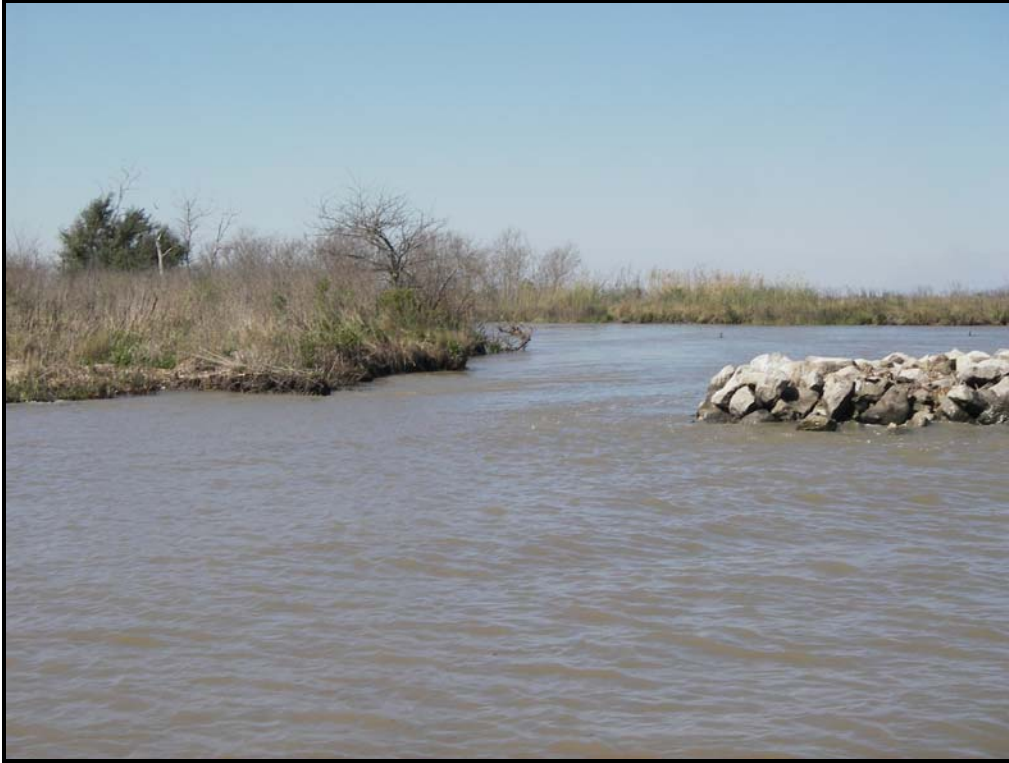
Photo 7, Closure No. 6. Note breach on south end of closure stone fill. Breach had begun prior to Hurricane RITA, but was not as wide.