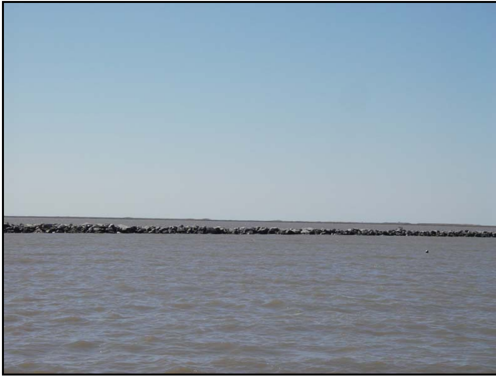
Photo 5, Typical view of Lake Sand Closure No. 4.