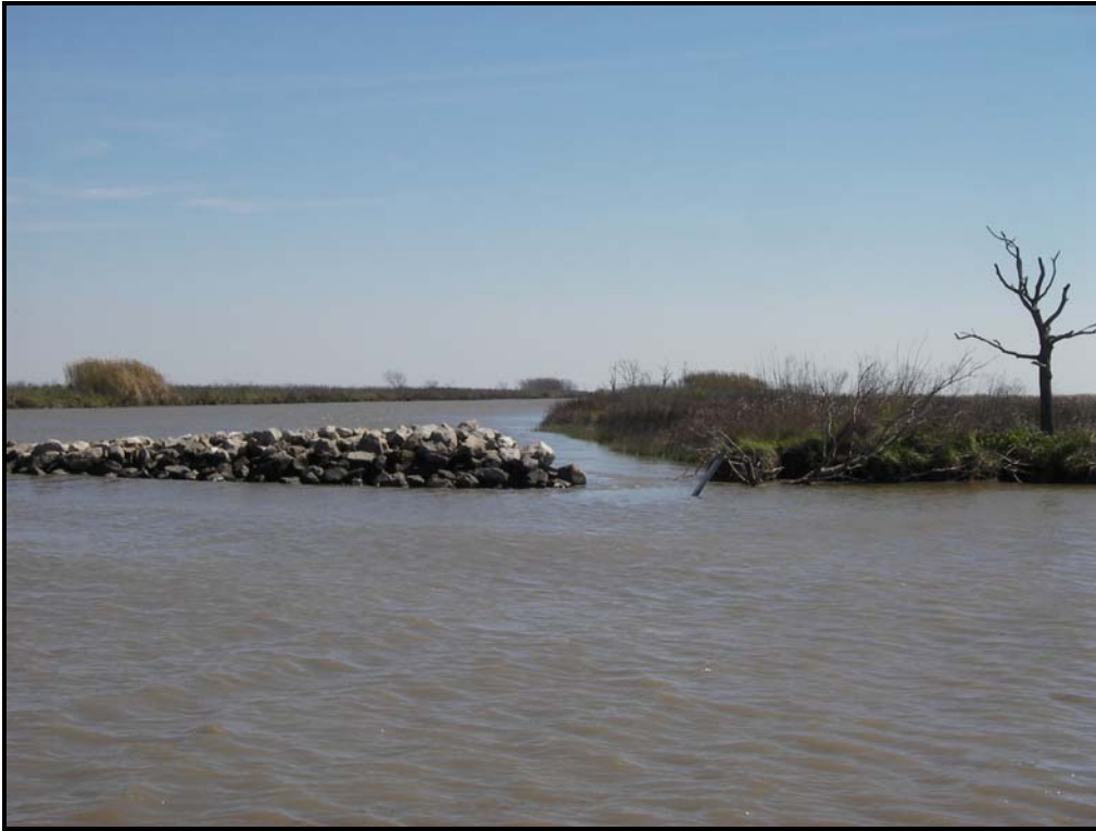
Photo 9, Closure No.8, View looking east showing breach on southern end of rock plug.