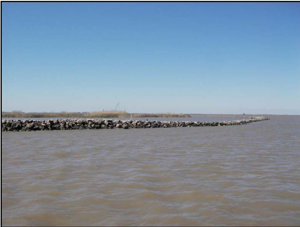
Photo 8, Shoreline protection at Site No. 7.