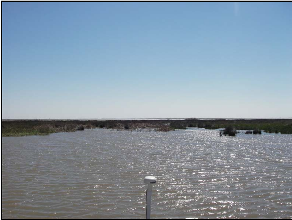
Photo 3, Area between West End of Closure No.3 and East End of Closure No.2, showing narrow section of marsh requiring shoreline protection.