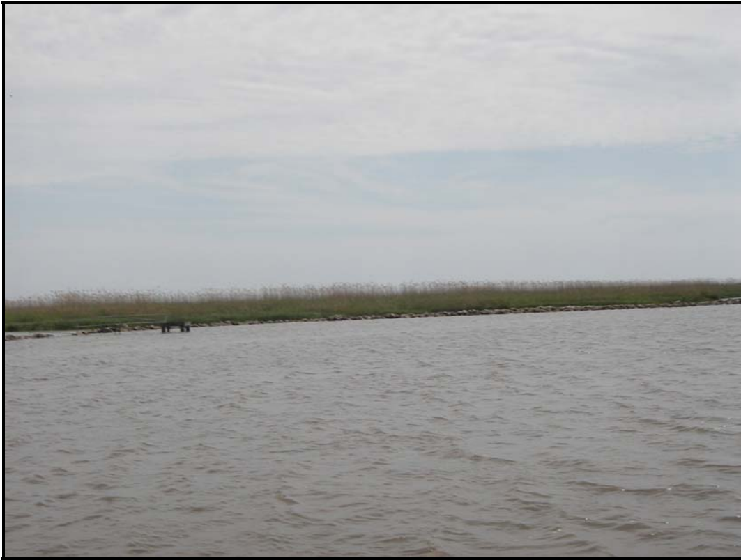
Photo 3 -typical rock dike section