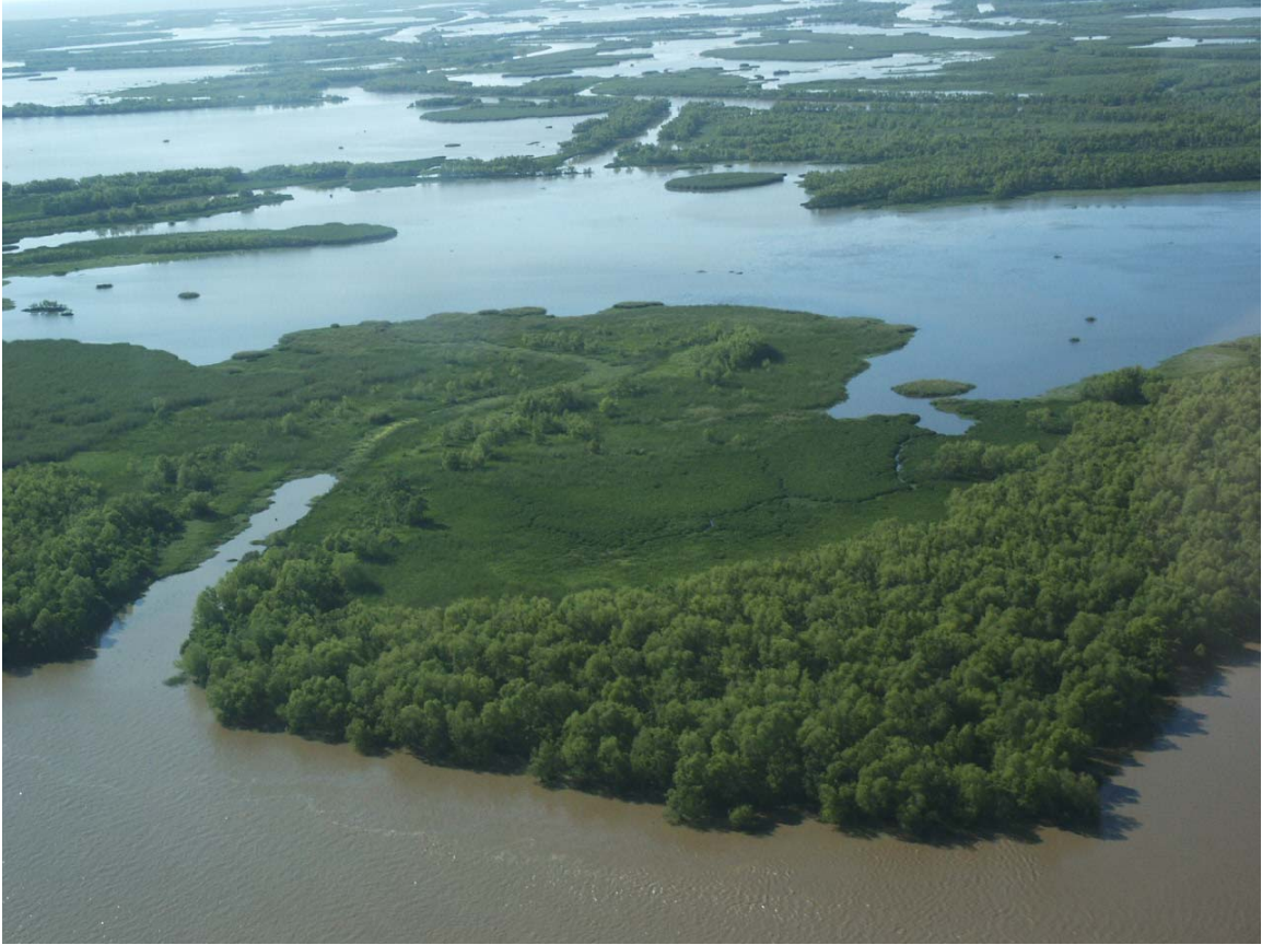
Photo 1. Crevasse 9 Before-Dredge aerial photo. Photo taken over Pass a Loutre facing southerly.