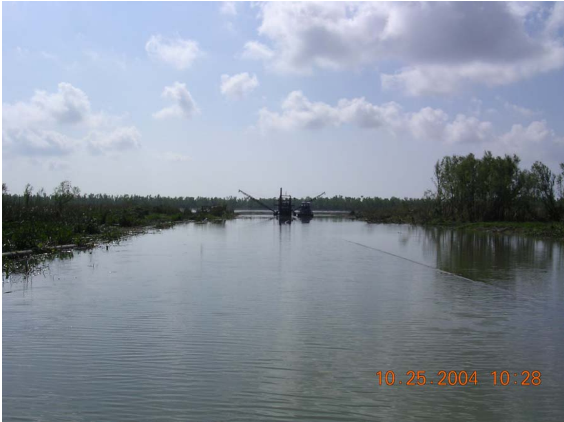
Photo 5. Crevasse 9, view toward the end of crevasse, facing southerly.