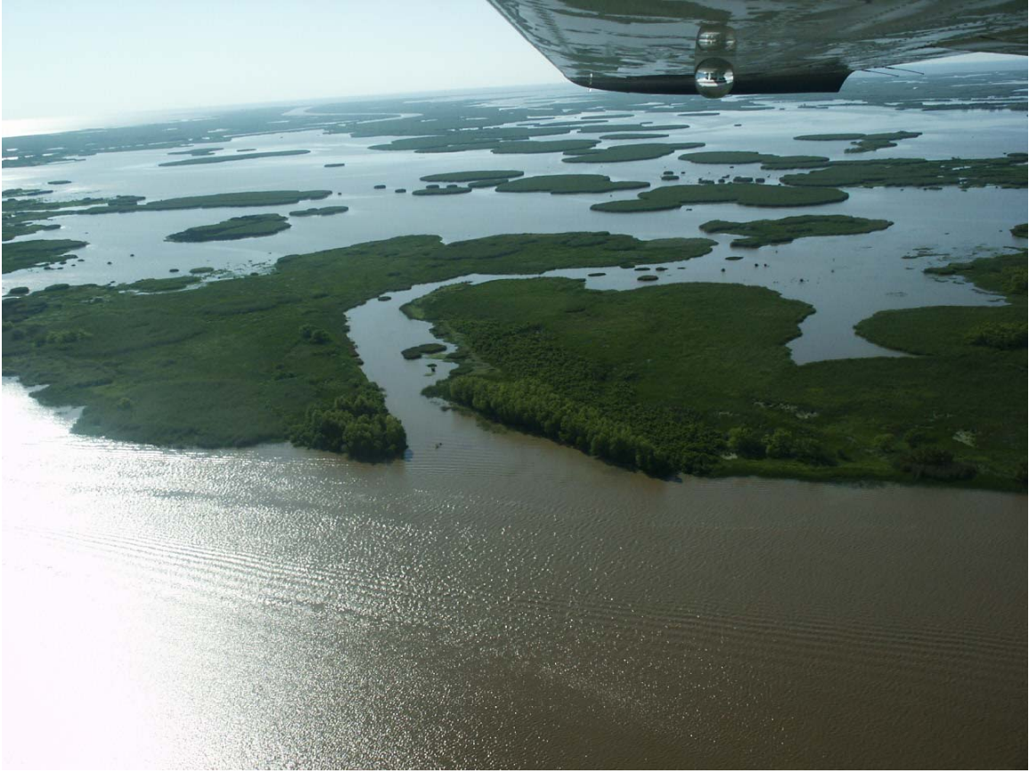
Photo 12. Before-Dredge photo taken over Pass a Loutre, facing southwesterly.