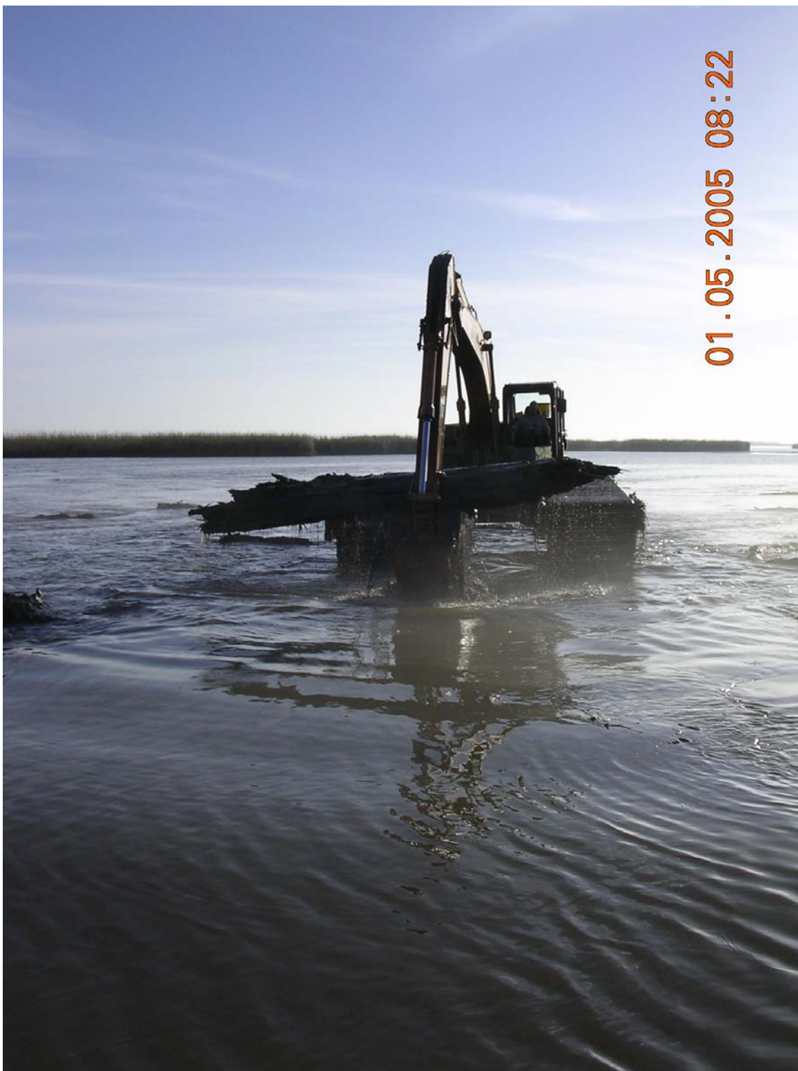
Photo 16. Marsh excavator removing submerged logs ahead of dredge.