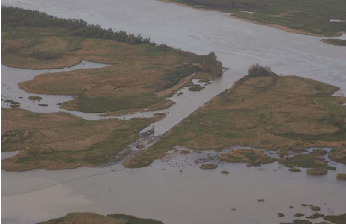
Photo 18. Photo taken dredging operations at Crevasse 11.