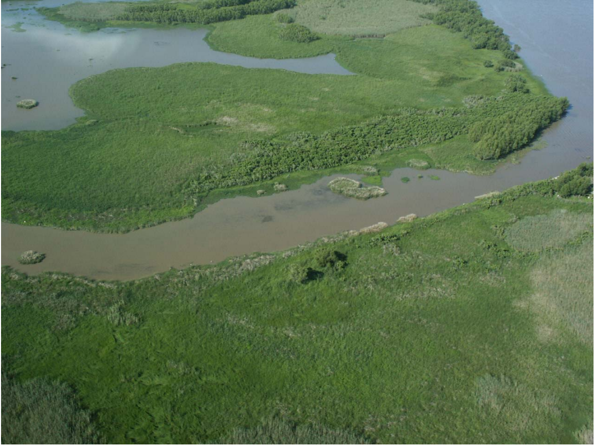
Photo 13. Before-Dredge photo taken on the east side of Crevasse 11.