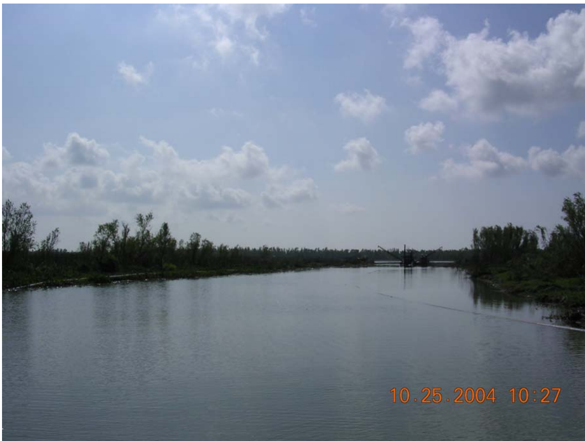
Photo 4. Crevasse 9 at P.I. in alignment, facing southerly.