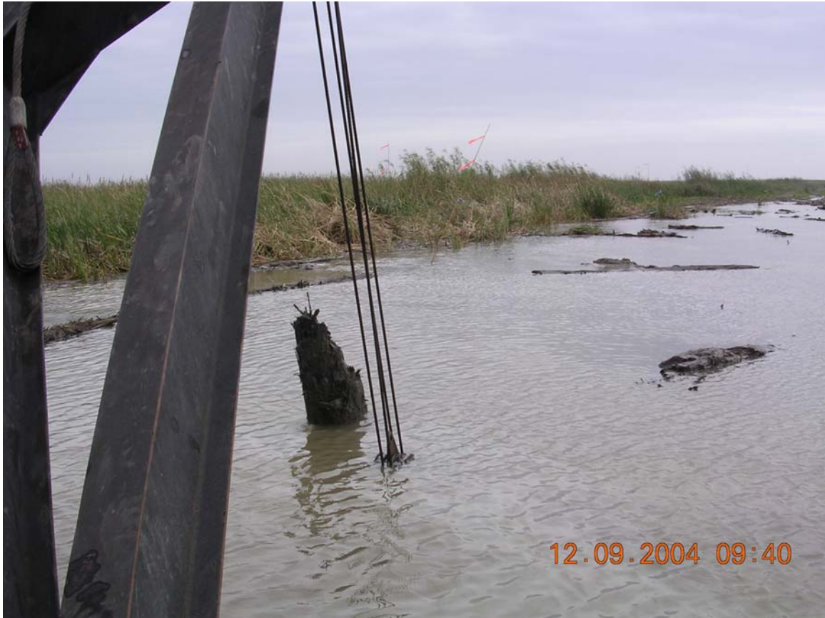
Photo 14. The contractors progress was severely impeded due to frequent encounters with submerged logs and debris.