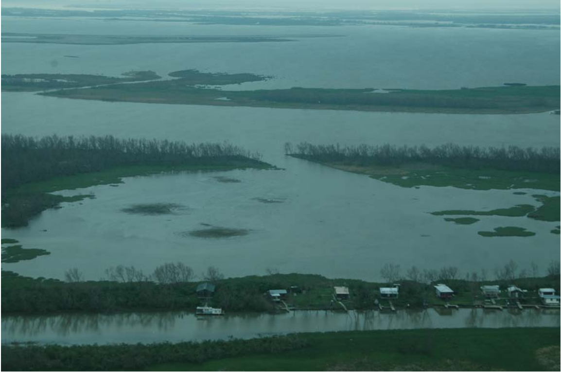
Photo 9. Crevasse NC-1 After-Dredge photo, facing Pass a Loutre.