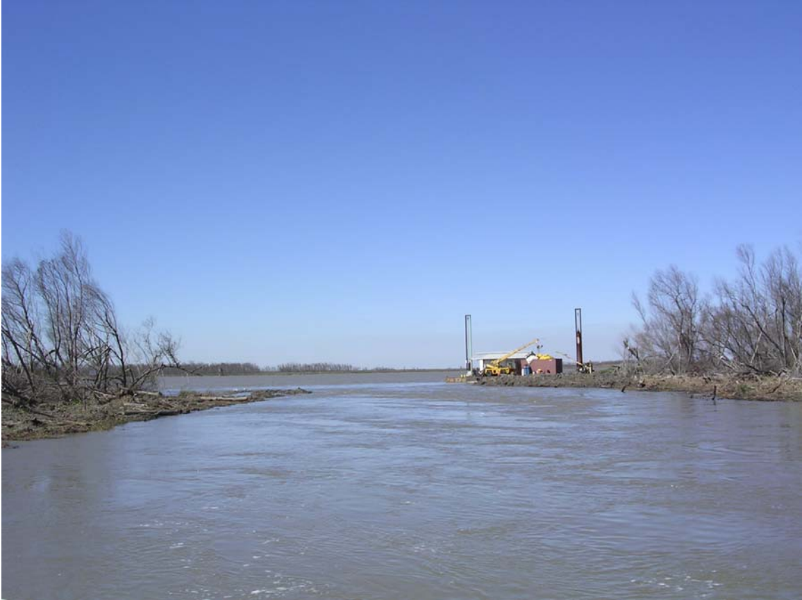
Photo 24. Crevasse NC-3 facing South Pass.