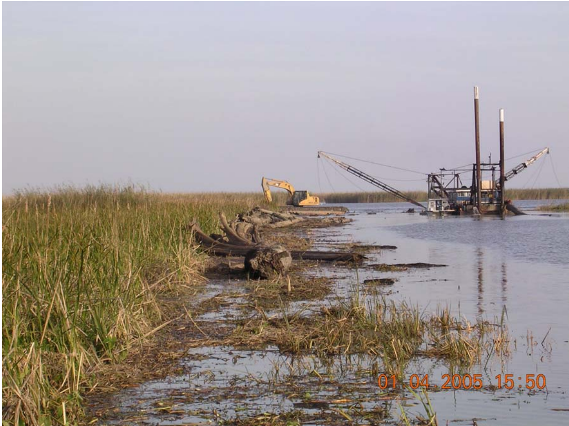
Photo 15. Logs and debris removed from Crevasse 11.