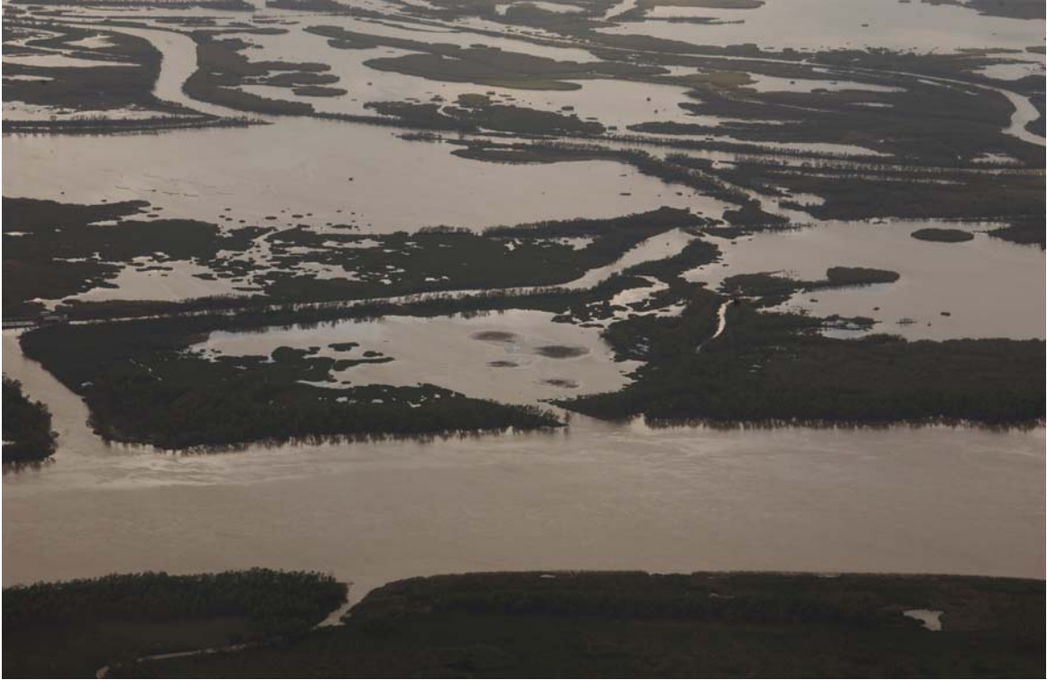
Photo 10. Photo showing spoil area (approx. center of photo) at Crevasse NC-1.