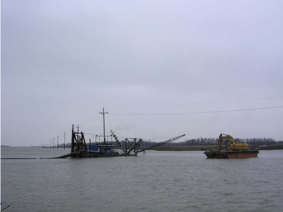
Photo 27. Dredging at Crevasse 81 prior to power line crossing.