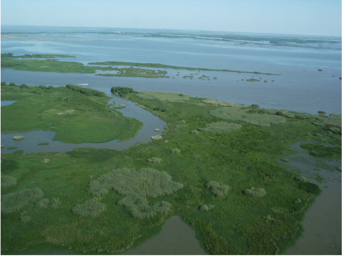
Photo 11. Before-Dredge photo of Crevasse 11 area, facing Pass A Loutre.