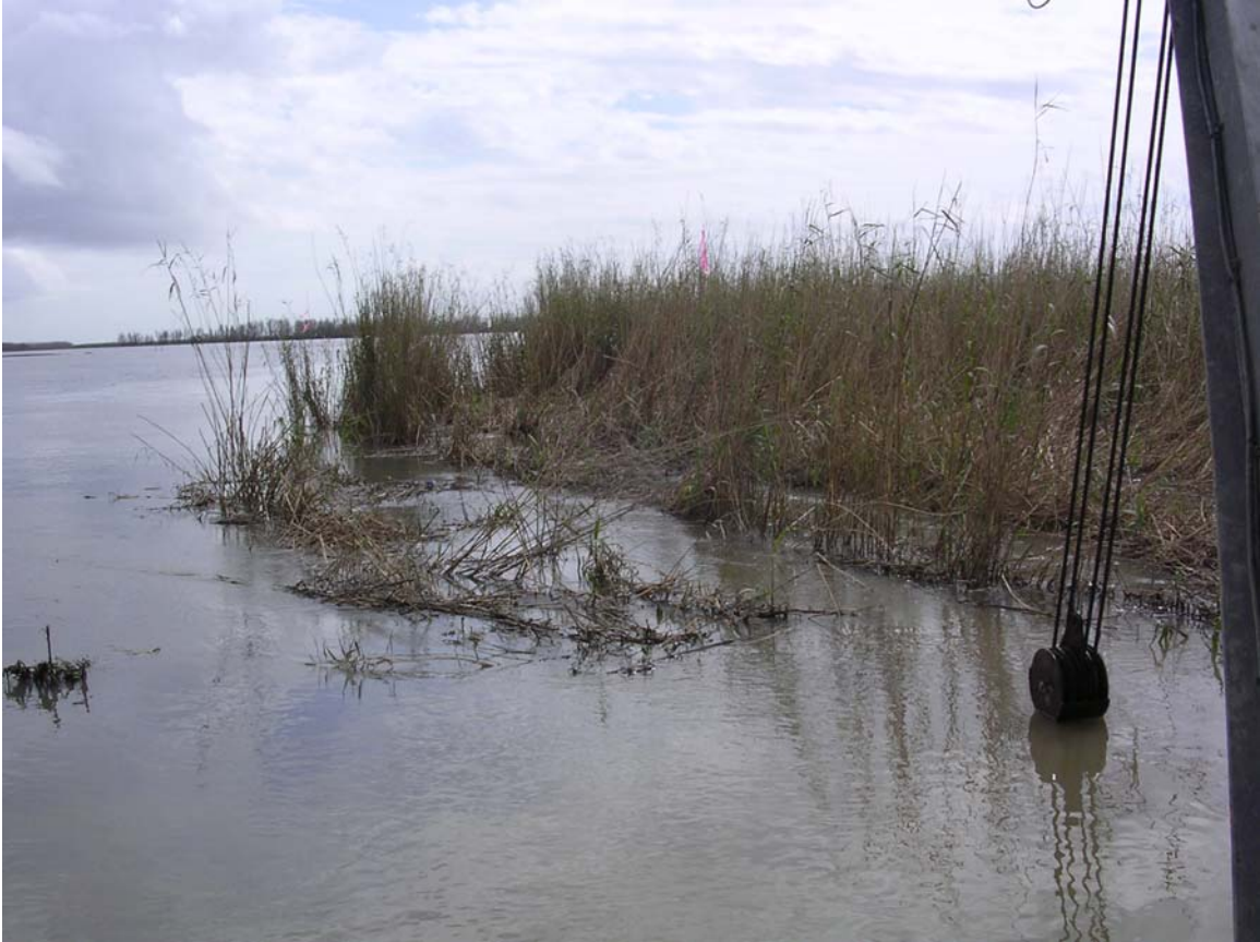
Photo 29. Nearing the end of Crevasse 81, facing southwesterly.