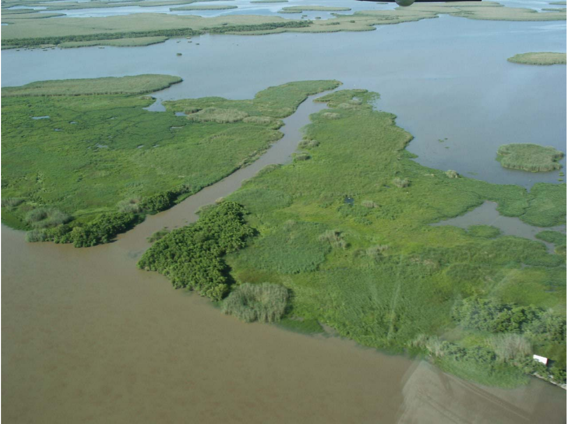
Photo 21. Before-Dredge photo near the mouth of Crevasse 12, facing westerly.