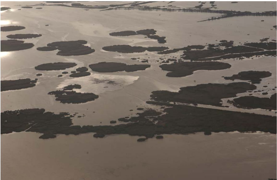
Photo 19. Spoil area at Crevasse 11.