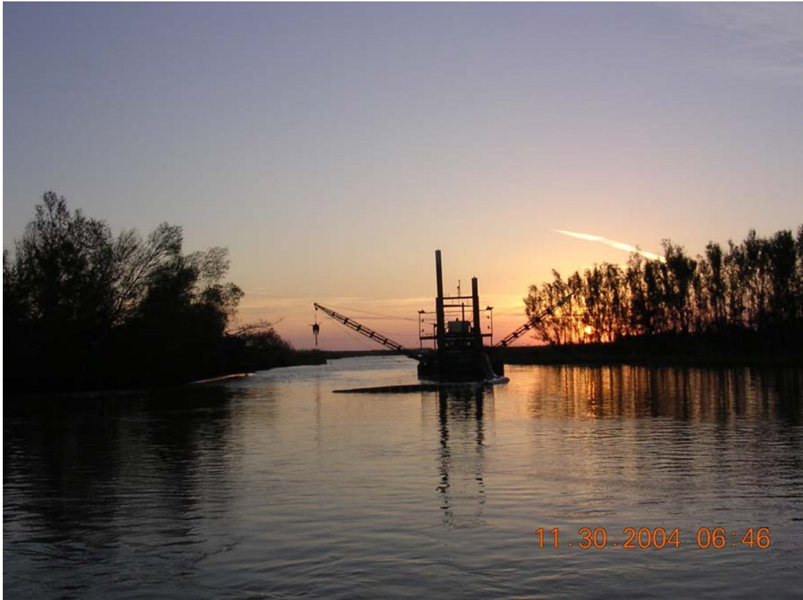
Photo 20. Sunrise on Crevasse 11.