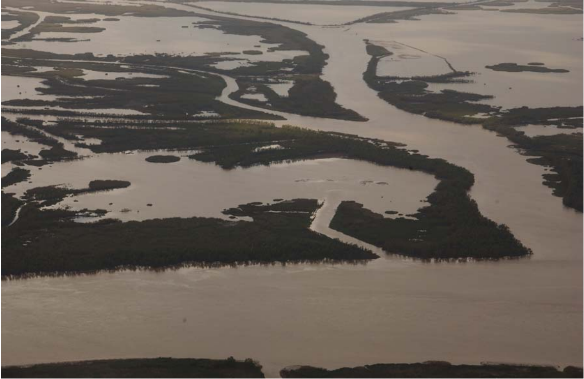
Photo 7. Crevasse 9 After-Dredge aerial photo, facing southerly.