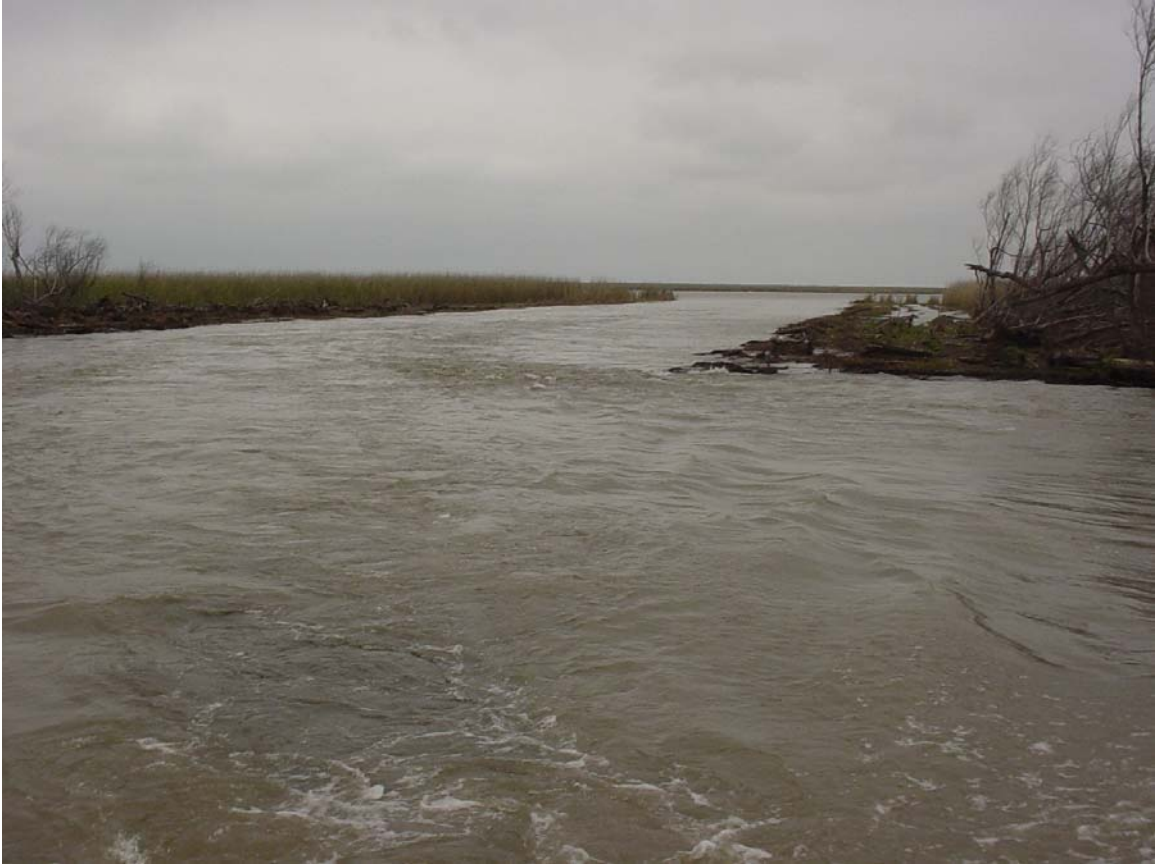
Photo 25. The mouth of Crevasse NC-3, facing easterly from South Pass. Very strong current was experienced for the duration of dredging operations at Crevasse NC-3.