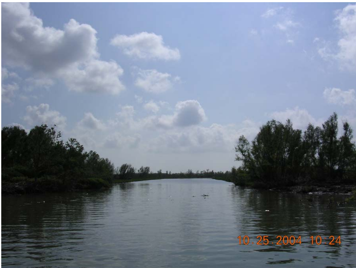
Photo 3 . The mouth of Crevasse 9, facing southerly.