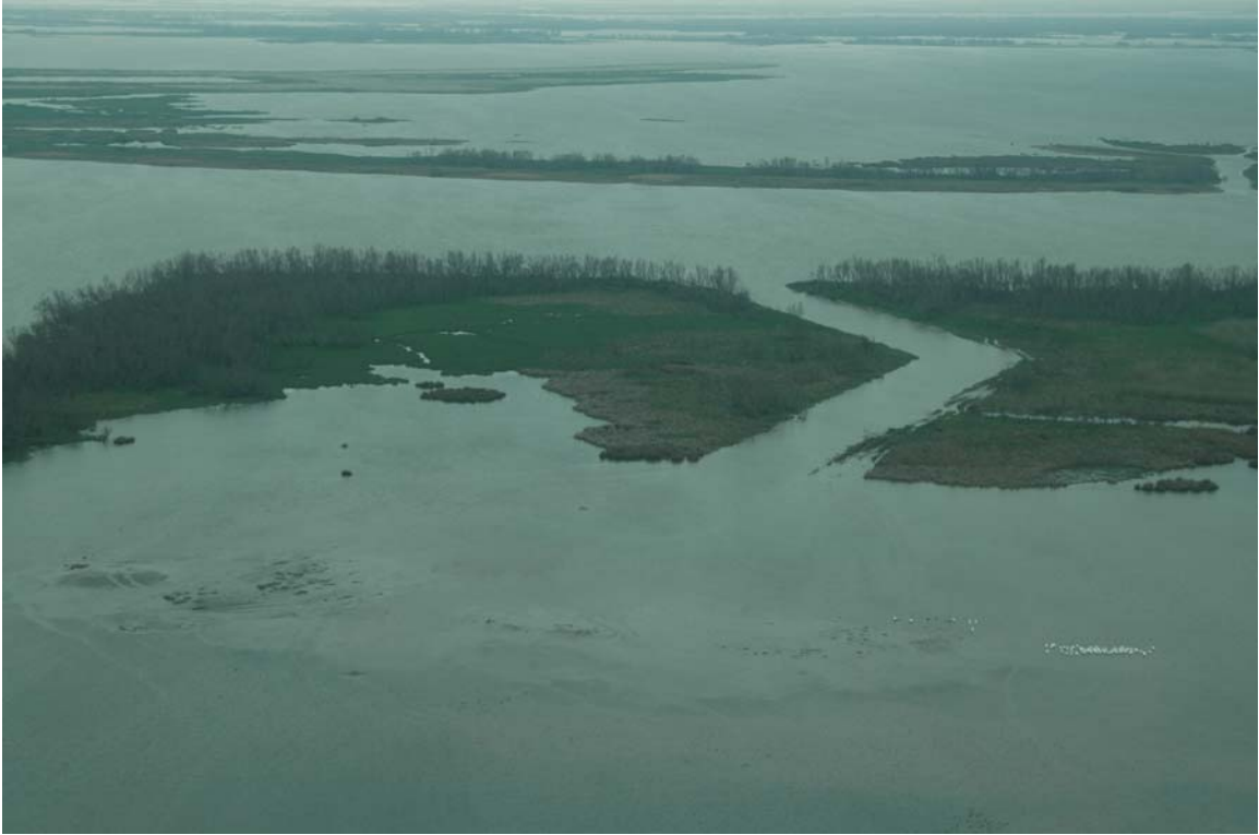
Photo 6. Crevasse 9 After-Dredge photo, taken over spoil area, facing Pass a Loutre in a northerly direction.