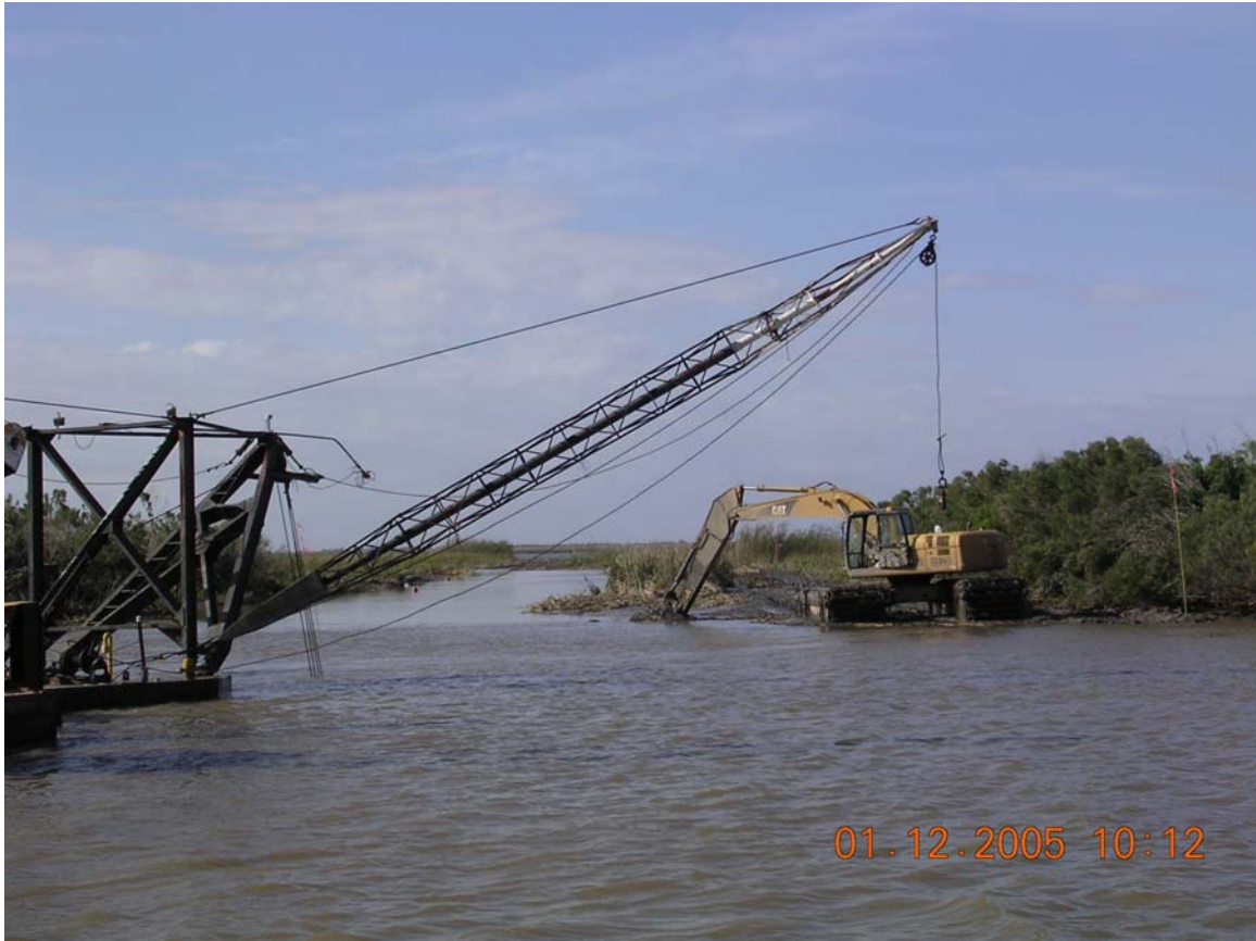
Photo 22. First day of dredging at the mouth of Crevasse 12.