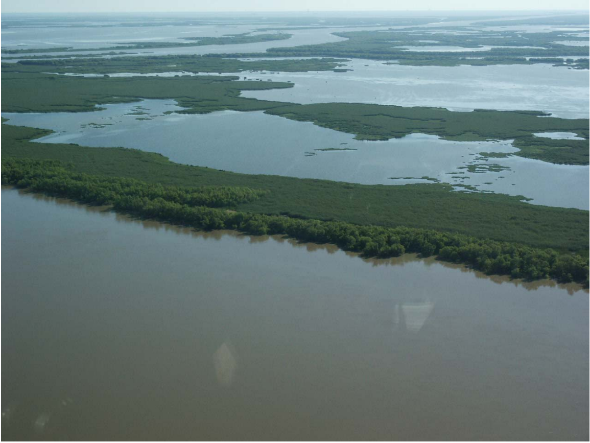
Photo 23. Proposed Before-Dredge Crevasse NC-3 area. Photo taken over South Pass facing approx. northeasterly direction