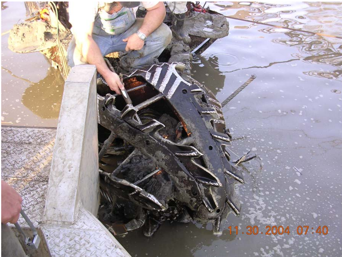
Photo 17. Cutting cable from cutterhead.