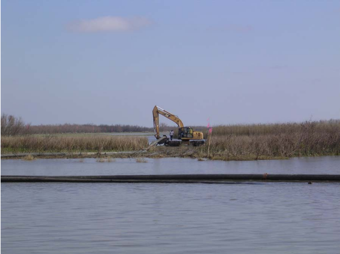
Photo 26. Contractor laying out discharge pipe into Crevasse 81. Photo taken from Baptiste Collette, facing southerly.