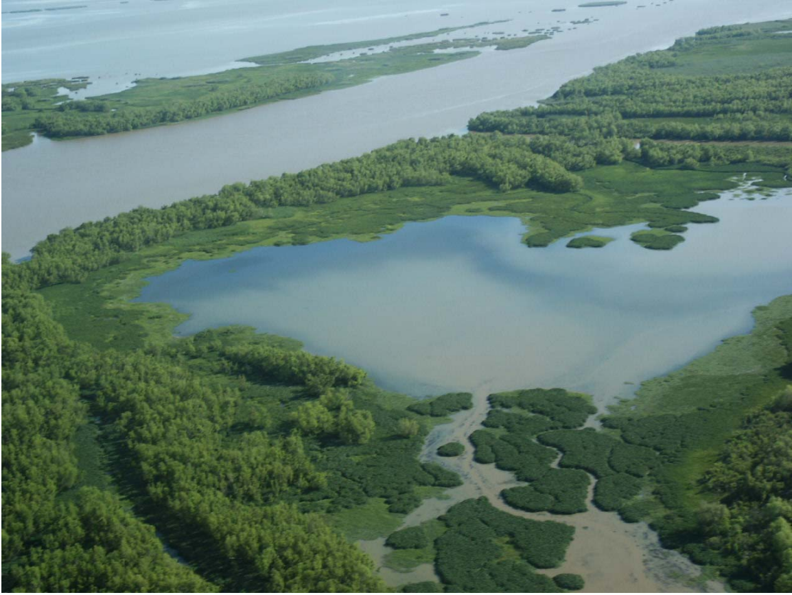
Photo 8. Before-Dredge photo of proposed NC-1 area, taken near Dennis Pass, facing in a northeasterly direction.