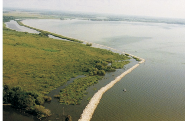
A foreshore rock dike, such as the one shown above, may provide an alternative type of shoreline protection to the eastern shoreline of East Cote Blanche Bay.

This project is on Priority Project List 13.