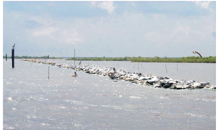
Brown pelicans are using this rock dike located in Lafourche Parish.