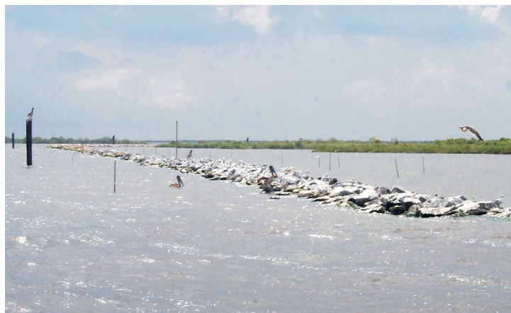
Brown pelicans are using this rock dike located in Lafourche Parish.