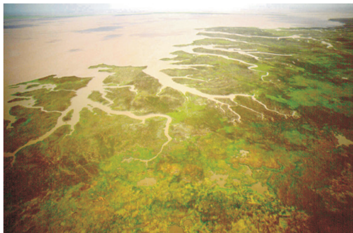
Shoreline and bank erosion occurring in Weeks Bay between Mud Point and Weeks Island.