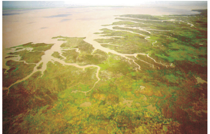
Shoreline and bank erosion occurring in Weeks Bay between Mud Point and Weeks Island.