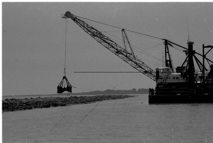
The proposed terraces at Four Mile Canal will be constructed in a similar fashion as shown above. The above photo is of the Captain Buford Berry constructing terraces at the project at Little Vermilion Bay (TV-12).

Reduction of shoreline erosion will be achieved by the buffering capacity of the constructed terraces. The proposed terrace layout is very different for each area of the project. The "fish net" design for Little Vermilion Bay is designed to allow sediment deposition and the terraces in Little White Lake are aligned to reduce the wind generated waves, thus reducing shoreline erosion. Thus, marsh habitat will be created in two ways within the Four Mile Canal Terracing Project area. First, marsh will immediately be built by creating approximately 90 terraces from dredged material and planting them with smooth cordgrass. This action alone will create 70 acres of subaerial land. Second, by reducing fetch and wave energy, terraces will promote the deposition of suspended sediments in the shallow water adjacent to the terrace edges in Little Vermilion Bay and Little White Lake. This will slowly build marsh over the life of the project as subaerial land is built and plants naturally become established.