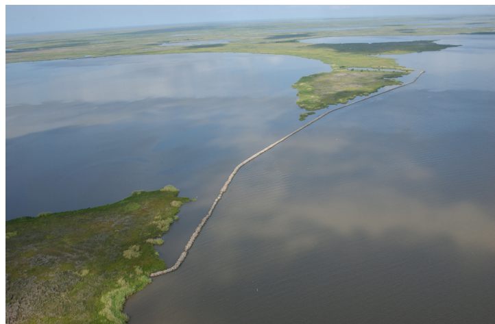
Project features include shoreline protection, canal closures, and isolation of Lake Sand from Vermilion Bay with a rock dike on the northeastern edge of Marsh Island. View is looking west.

The project increases marsh, fish, and wildlife productivity by reducing shoreline erosion and correcting altered hydrology.