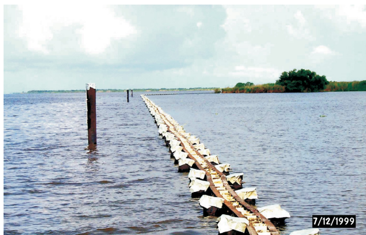
This sheet-pile structure provides protection to the eroding shoreline. Metal caps were placed on the pilings to prevent the rotting of the wood.