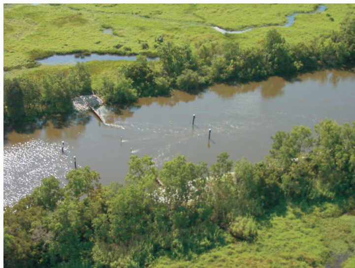
A low-level weir constructed across the British American Canal within the project area.

The most notable effect of the project was a reduction in the range of water level fluctuation. Since the project was completed, preliminary analysis of monitoring data indicates the range in water level fluctuation increased or showed no change in the reference area, but decreased in the project area. This project is on Priority Project List 3.