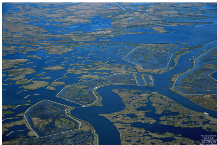
TE-72 marsh creation cells along Bayou DeCade. Recent vegetative growth can be seen on some of the newly-deposited dredged material in this December 2019 photo.

by fixed-crest weirs. Structures with bays/gates were installed to increase freshwater and sediment delivery into those marshes. A similar structure was also installed along Little Carencro Bayou to increase freshwater and sediment delivery into the marshes north of Lost Lake.