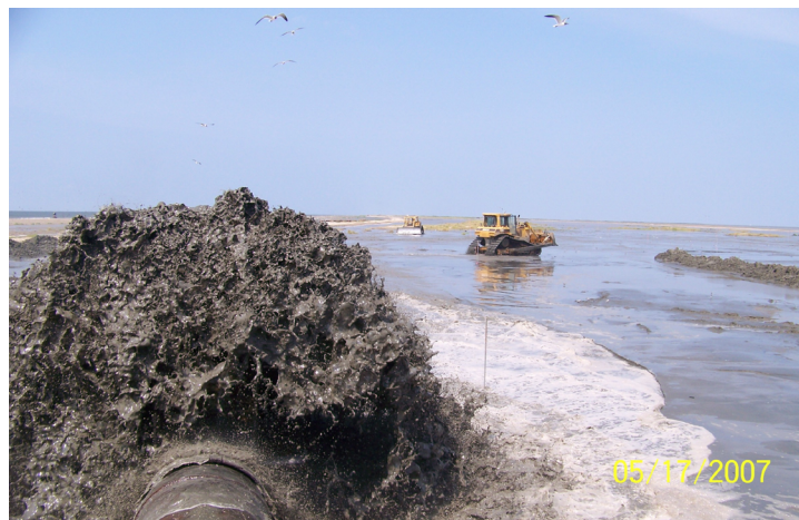
Pumping of dredged sediments on New Cut.