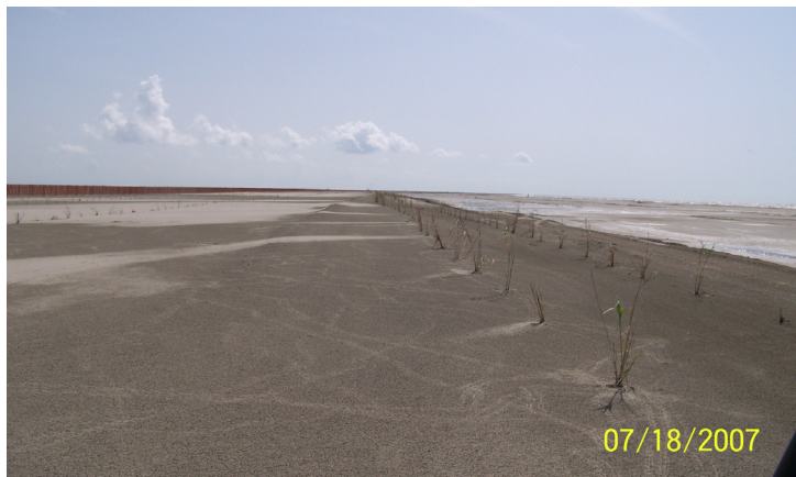
Vegetative plantings and dune features on date of final project inspection.

The Isles Dernieres shoreline is one of the most rapidly deteriorating barrier shorelines in the United States. This barrier system is exhibiting a pattern of fragmentation and disintegration. With regard to longshore sediment transport systems or the movement of beach material by waves and currents, the islands have ultimately become sources of sediment themselves leading to an ever-decreasing volume of sediment.