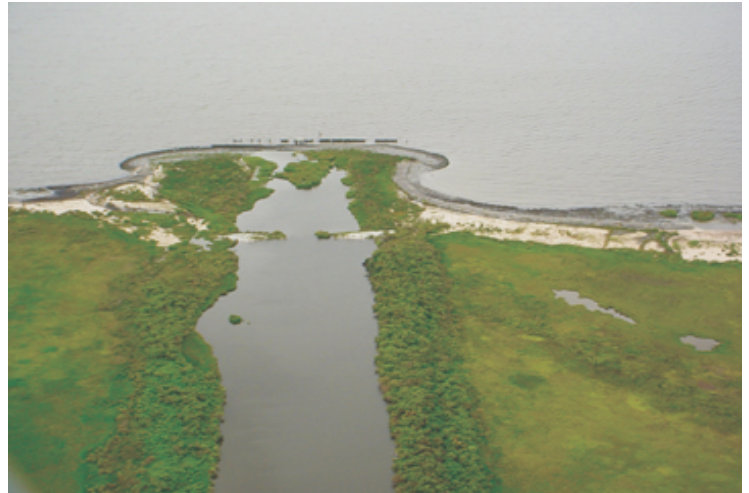
The beach where a pipeline canal meets the Gulf of Mexico has been stabilized with concrete mats thus preventing saltwater intrusion into the interior wetlands of Point au Fer Island.

The shoreline erosion rate along the plugged canals (Phase/Area 1) has not been reduced. Visual observations indicate that the shoreline stabilization project (Phase/Area 2) has halted erosion, but monitoring data is still under analysis. This project is on Priority Project List 2.