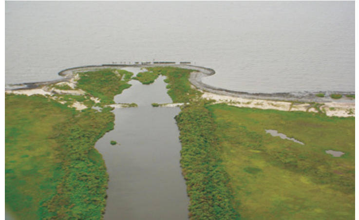
The beach where a pipeline canal meets the Gulf of Mexico has been stabilized with concrete mats thus preventing saltwater intrusion into the interior wetlands of Point au Fer Island.

The shoreline erosion rate along the plugged canals (Phase/Area 1) has not been reduced. Visual observations indicate that the shoreline stabilization project (Phase/Area 2) has halted erosion, but monitoring data is still under analysis. This project is on Priority Project List 2.