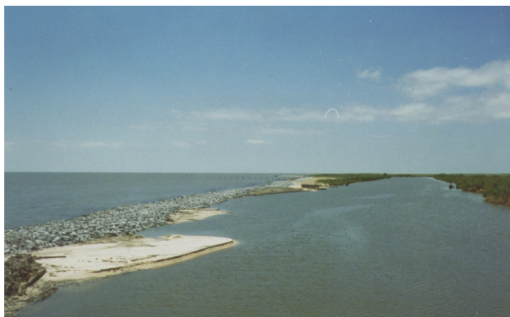
This section of Mobil Canal was backfilled and armored with rock to reestablish the separation between the canal and the gulf so that salt water would be prevented from damaging the intermediate marshes in the interior of the island.