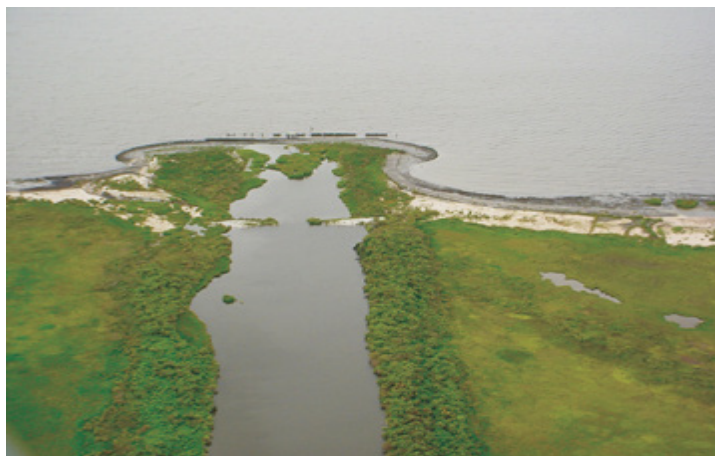
The beach where a pipeline canal meets the Gulf of Mexico has been stabilized with concrete mats thus preventing saltwater intrusion into the interior wetlands of Point au Fer Island.

The shoreline erosion rate along the plugged canals (Phase/Area 1) has not been reduced. Visual observations indicate that the shoreline stabilization project (Phase/Area 2) has halted erosion, but monitoring data is still under analysis. This project is on Priority Project List 2.