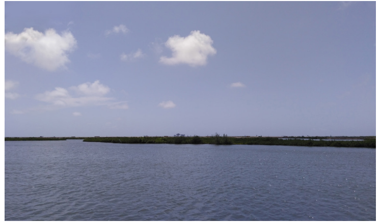
Site of Port Fourchon Marsh Creation (TE-171) taken during the Wetland Value Assessment in Summer of 2021.

The primary goals of this project are to restore degraded wetland habitat and provide increased protection from storm surge and flooding. Specific goals of the project are to create approximately 445 acres and nourish approximately 98 acres of marsh with dredged material from Belle Pass. The project would also evaluate the use of Belle Pass sediment for coastal Restoration and demonstrate cost sharing opportunities with local stakeholders. This project helps to further EPA CWPPRA Team goals by improving local community resilience, restoring wetland habitats and protecting critical infrastructure, and supporting stakeholder priorities in synergy with EPA's mission.