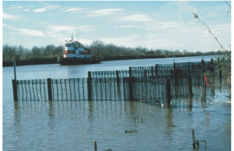
One of the six types of wave-damping structures tested for their ability to protect the canal's shoreline.

The Comprehensive Monitoring Report of June 2000 reported that none of the vegetative plantings survived the period of study. Likewise, although the structures remained in place, subsequent shoreline erosion rates were not reduced. Monitoring has ceased, and the Comprehensive Monitoring Report was accepted by the sponsoring agencies as the closeout report. This project is on Priority Project List 1.