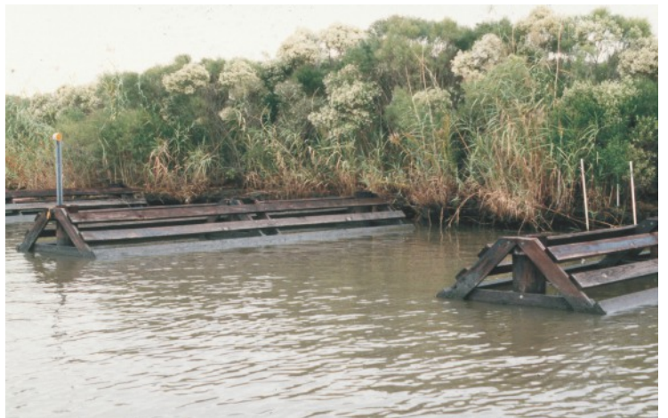
Another one of the six designs tested in the shoreline protection study.

For more project information, please contact: