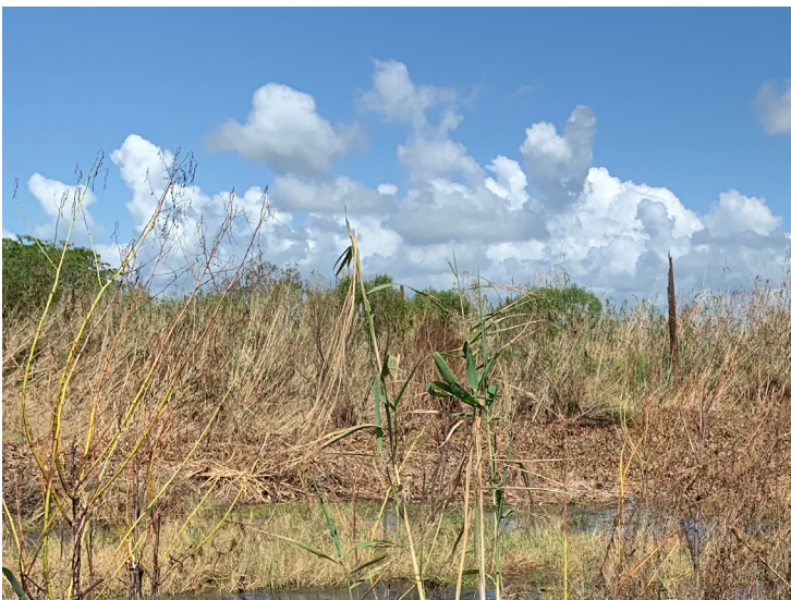
Post project degraded marsh and open water.

High saline waters from Lake Mechant have directly contributed to the loss and/or conversion of much of the historically intermediate marshes to low salinity brackish marshes north of Lake Mechant. Subsidence, canal dredging and storm damage have also contributed significantly to the loss of marsh in the area. The zone of intermediate marsh (transition zone between fresh and brackish marshes) is located just north of Lake Merchant. High salinity water entering Bay Raccourci via Bayou Raccourci/Lake Mechant flows unimpeded into low salinity marshes surrounding Bayou Raccourci, effectively short circuiting the TE-44 Project. The 1984 to 2016 USGS loss rate is -0.32%/yr for the extended boundary area.