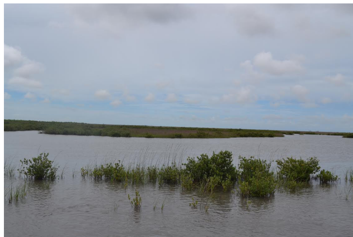
Smooth cordgrass marsh and black mangroves at the site of the West Fourchon Marsh Creation and Nourishment project.

This project would create 295 acres and nourish 242 acres of open water, emergent saline smooth cordgrass marsh, and black mangrove habitat using material dredged from the Gulf of Mexico, southwest of the project area. Earthen containment dikes will be constructed along the project boundaries to contain the material. Containment dikes will be degraded or gapped by TY3 to allow access for estuarine organisms. Funding will be set aside for the creation of tidal creeks if needed. This project, along with TE-23 West Belle Pass Headland Restoration and TE-52 West Belle Pass Barrier Headland Restoration, will help stabilize the edge of the marshes and protect Port Fourchon from the west. The initial construction elevation is +2.0 feet NAVD 88 GEOID12A. After settlement, even with subsidence and sea level rise, the created marsh is expected to remain in the optimal inundation range over the 20-year project life.