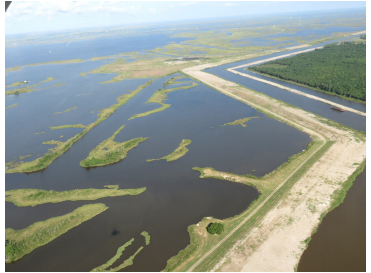
Aerial view from the southeast looking towards the northeast section of Catfish Lake. The project will hydraulically dredge material from the lake to restore the fragmented marsh along the lake rim.

The goal of the project is to create marsh habitat and reestablish the northern shoreline of Catfish Lake. Sediment dredged from Catfish Lake will be used to strategically create marsh along the northern shoreline. Smooth cordgrass will be planted along the lake shore-face to help stabilize the shoreline and reestablish a healthy lake rim marsh community. Sediments will be hydraulically dredged from Catfish Lake and pumped via pipeline to create approximately 525 acres of marsh habitat and nourish an additional 208 acres of marsh habitat.