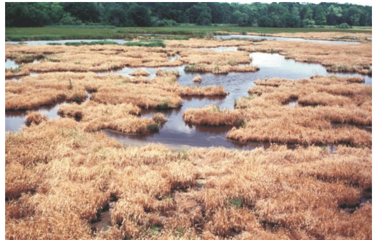
Browened and stressed marshes within the project area.

For more project information, please contact: