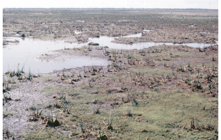
Deteriorated intermediate marshes within the interior portion of project area.

This project is on Priority Project List 5.