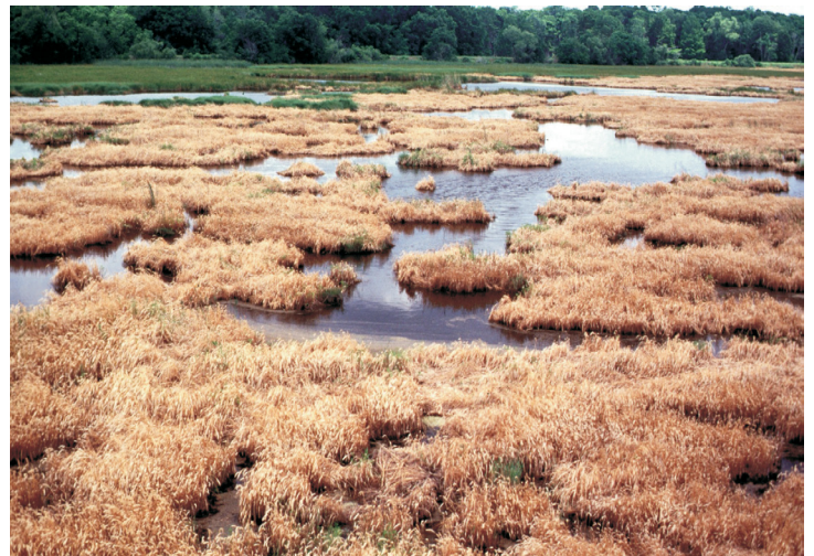
Browned and stressed marshes within the project area.