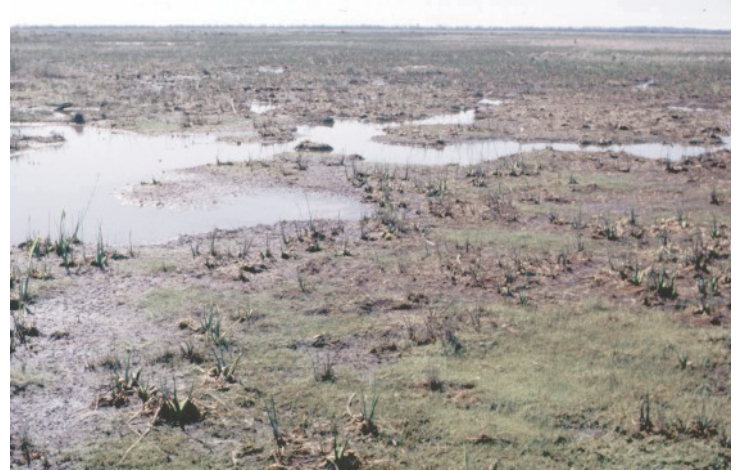
Deteriorated intermediate marshes within the interior portion of project area.

This project is on Priority Project List 5.