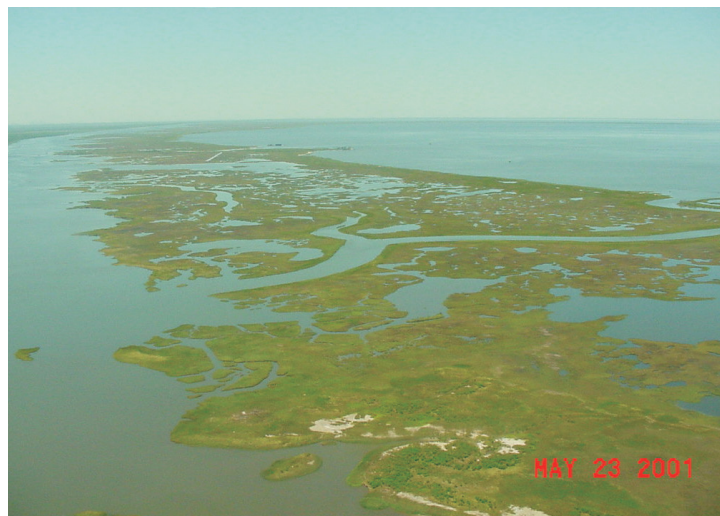
This project will help protect the fragile landbridge separating the MRGO (left side of picture) and Lake Borgne (upper right). Doulluts Canal is also visible in this photograph.

The objective of this project is to preserve the marsh between Lake Borgne and the MRGO by preventing shoreline erosion. In order to accomplish this objective, an 18,500 linear foot rock dike will be constructed along the Lake Borgne shoreline from Doulluts Canal to Jahnckes Ditch. A 14,250 linear foot rock dike will also be constructed along the north bank of the MRGO from Doulluts Canal to Lena Lagoon. Both dikes will have a layer of armor stone placed on top of a crushed stone core resting on a layer of geotextile fabric. Any flotation channel needed will be excavated with the spoil being placed behind the rock dikes. Gaps may be constructed in the dikes to allow organisms and water to move freely.