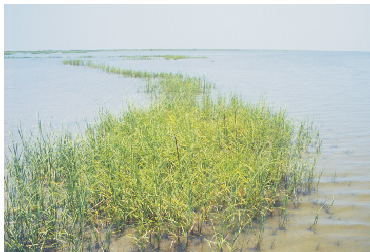
Aerial view of the Chandeleur Islands.