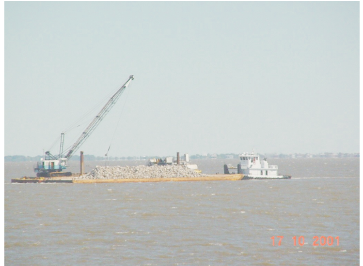
Fully-loaded barge of rock waiting to be unloaded at Bayou Chevee construction site.