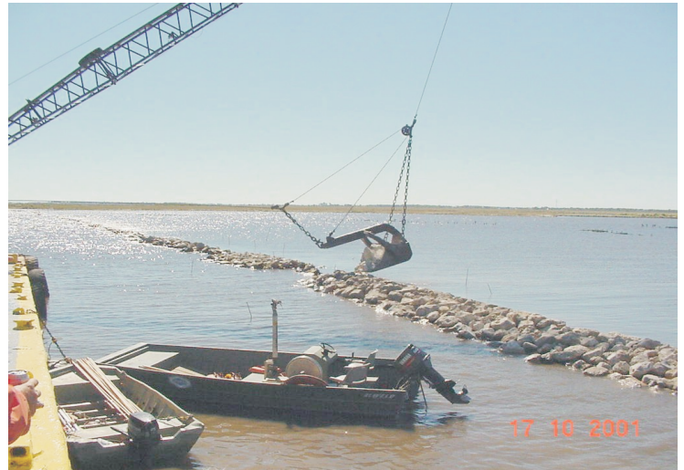
Rock being placed at Bayou Chevee.

For more project information, please contact: