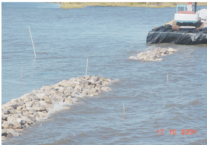
Rock dike at Bayou Chevee with fish dip.

This project is on Priority Project List 5.