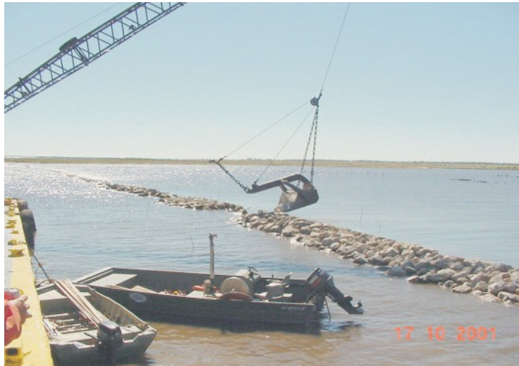
Rock being placed at Bayou Chevee.

For more project information, please contact: