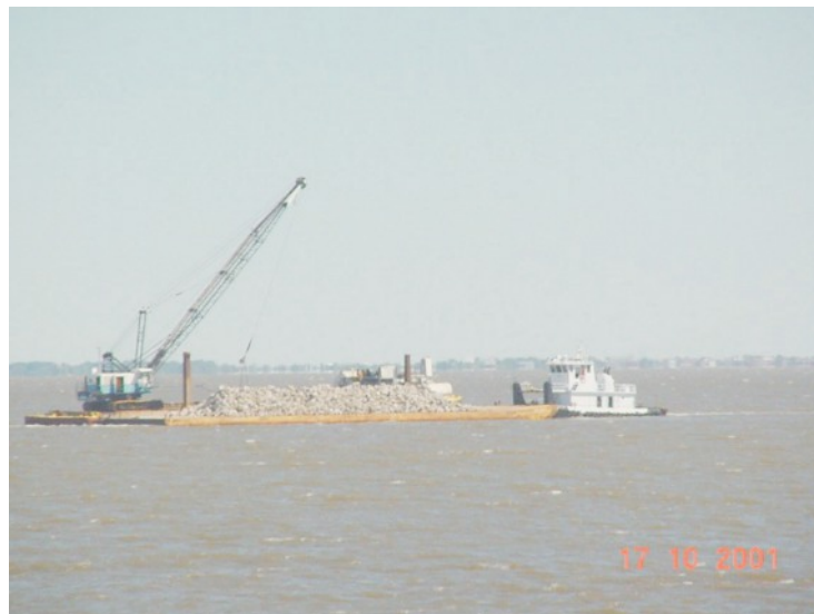
Fully-loaded barge of rock waiting to be unloaded at Bayou Chevee construction site.