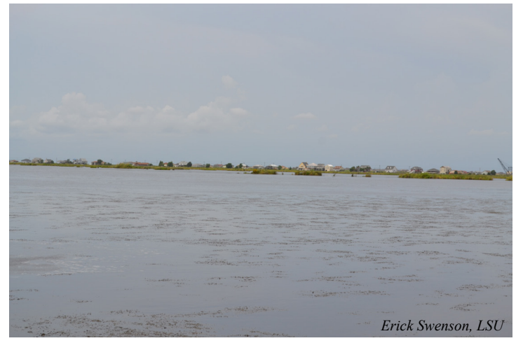
A view from the Fritchie Marsh in an area converted to open water with Hurricane Katrina. The project would create marsh and construct earthen terraces to restore coastal wetland habitat and afford some protection for subdivisions in the area.

A significant portion of the Fritchie Marsh was lost due to Hurricane Katrina. Post storm shallow open water areas dominate the landscape which limits the effectiveness of the PO-06 CWPRRA project. Wetlands in the project vicinity are being lost at the rate -1.09%/year based on USGS data from 1985 to 2015. These marshes cannot recover without replacement of lost sediment, which is critical if the northshore marshes are to be sustained.