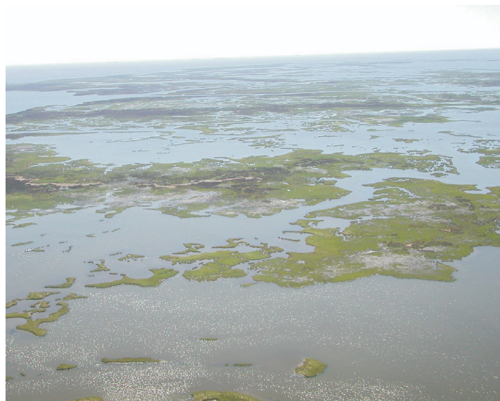
Large areas of marsh in the Mississippi River Delta have converted to shallow open water while much of what remains is deteriorated.

Beneficial use sites for the project are on the east and west banks of the river in West Bay, the Delta National Wildlife Refuge, and Pass a Loutre Wildlife Management Area. Initial construction of the sediment trap will create an estimated 1,440 acres of new wetlands in the western project area and 440 acres in the eastern project area.