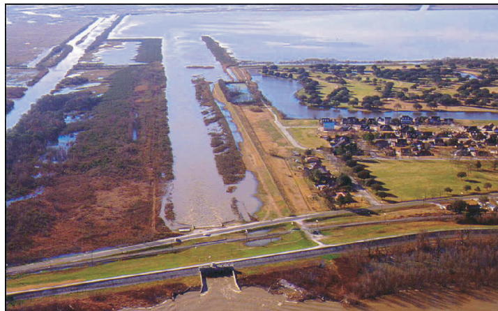
The Caernarvon diversion structure: a potential location of the sediment enrichment demonstration.

This project will be located on the Mississippi River between Baton Rouge and the Gulf of Mexico. Possible sites for this sediment enrichment application could be both the Caernarvon freshwater diversion structure as well as a siphon diversion.