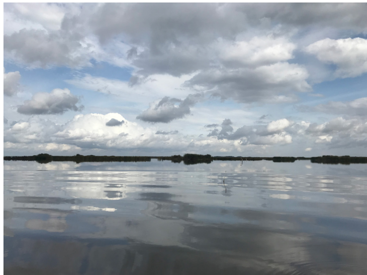
Large open water areas that were historically intermediate marsh are the focus for restoration.

Project features include creating and/or nourishing approximately 428 acres of marsh (291 acres of marsh creation and 137 acres of nourishment) in two marsh creation areas using dedicated dredged material from the Gulf of Mexico. The dredged material would be fully contained, and containment dikes will be degraded as necessary to reestablish hydrologic connectivity with adjacent wetlands. In case the area does not re-vegetate on its own, the maintenance cost estimate will include funds to plant 25% of the created marsh at Year 3. The project will restore the marsh platform and work synergistically with the NAWCA funded Freshwater Bayou Shoreline Stabilization project and the Freshwater Bayou Wetlands Protection (ME-04) project.