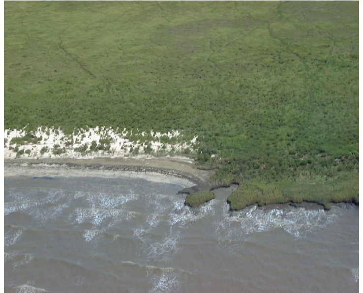
Southwest Louisiana Gulf Shoreline

This project is listed on Priority Project List 16.