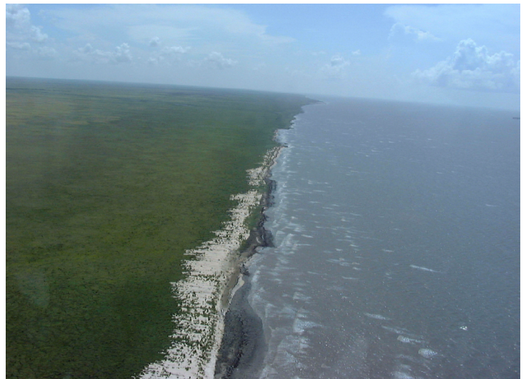
Southwest Louisiana Gulf Shoreline