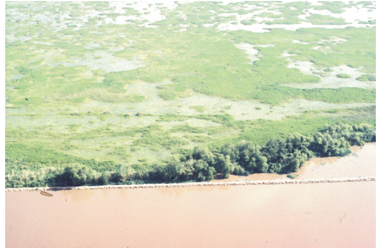
The shoreline protection dike running along the northern shore of the GIWW. Gulf.

The project's effectiveness is being evaluated by shoreline movement surveys and by comparing pre-construction and post-construction aerial photographs for changes in marsh loss rates.