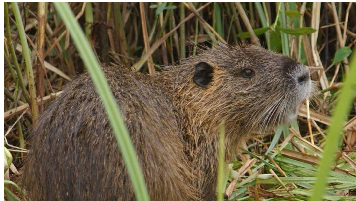
Mature nutria are very prolific, leading to a high population. Without significant annual harvest, nutria can cause significant damage to marshes and swamps in coastal Louisiana.