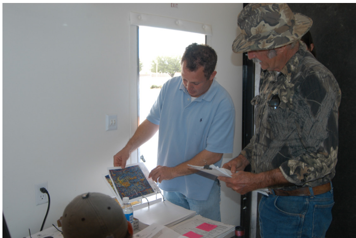
Nutria harvest locations are recorded in an effort to compare harvest levels and occurrence of herbivory damage.

The Coastwide Nutria Control Program is designed to remove about 400,000 nutria annually. The control program consists of an incentive payment program to encourage nutria harvesting. The program is implemented by the Louisiana Department of Wildlife and Fisheries.