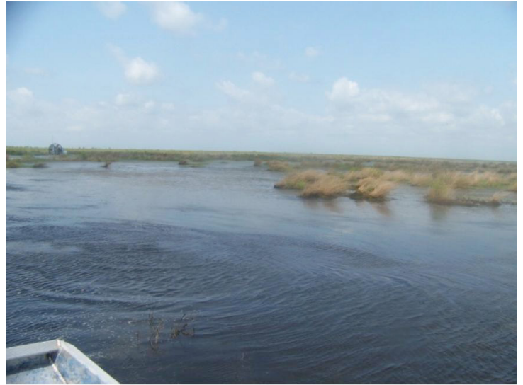
View of project receiving area; perspective taken from open water towards marsh edge.

Sediment will be hydraulically dredged from the Gulf of Mexico and pumped via pipeline to create approximately 380 acres of marsh (295 acres confined disposal and 85 acres unconfined disposal). Funds are included to plant approximately 180 acres. Approximately 12,150 linear feet of earthen terraces will be constructed in a sinusoidal layout to reduce fetch and wind-generated wave erosion. Terraces will be constructed to +3.0 feet NAVD88, 15 feet crown width, and planted. Terrace acreage will result in four acres of marsh above Mean Low Water.