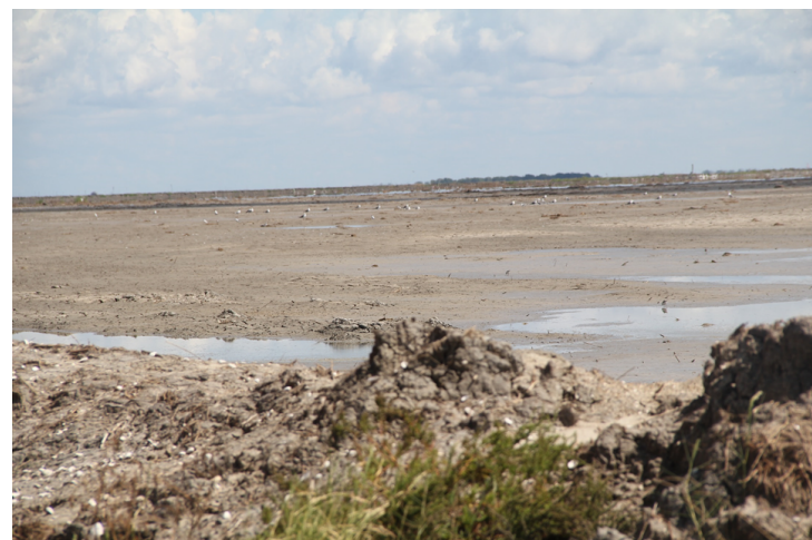
Looking northeast across an Oyster Bayou marsh creation area.