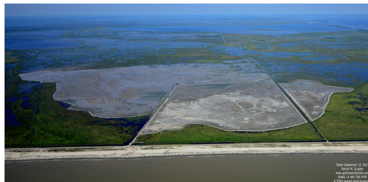
Looking northeast across the Oyster Bayou marsh creation areas.

Approximately 836 acres of marsh were created and nourished using sediment dredged from a Gulf of Mexico borrow area located about five miles south of the project site. Marsh ponds and tidal creeks were also constructed in the project site. About 13 acres of additional marsh area were created using unconfined disposal. Approximately 9,000 linear feet of earthen terraces were also constructed for the project. Containment dikes were gapped to improve access for fish and other aquatic organisms and create a functional marsh.