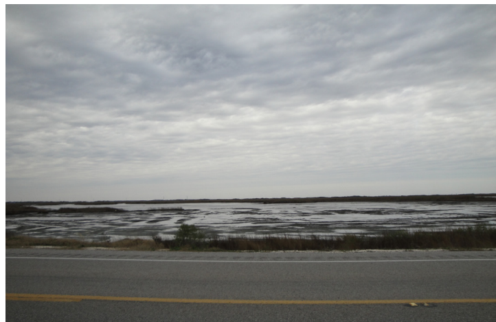
Interior marsh loss along Louisiana Highway 27 exposes the areas only hurricane evacuation route to increased storm impacts. features.

This project is on Priority Project List 20. Phase 1 funding approval for engineering and design was given by the Task Force in January 2011.