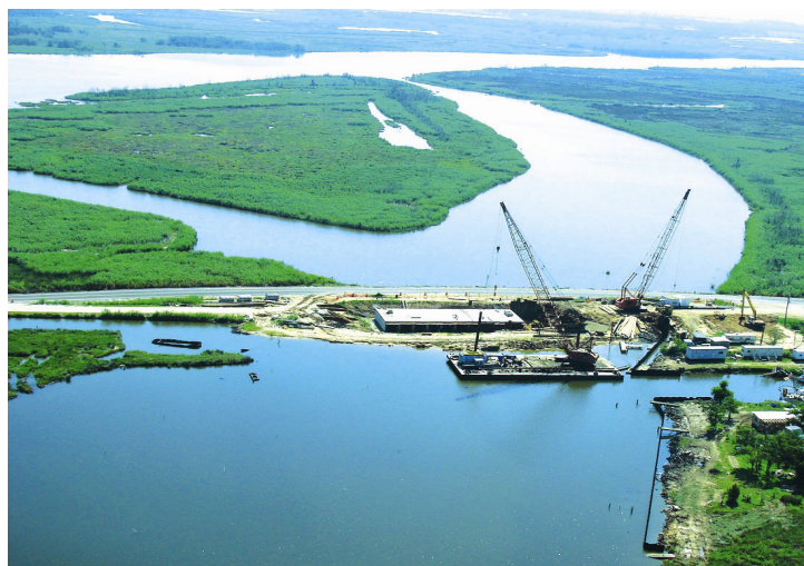
The construction of the Black Bayou Culverts will help the flow of floodwater out of the Calcasieu-Sabine basin while preventing saltwater intrusion from Calcasieu Lake.