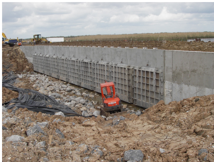
The construction of Black Bayou Culverts included ten 10 foot by 10 foot concrete box culverts under Highway 384 to help with drainage from Black Bayou to the Calcasieu River. The construction of Highway 384 had altered and effectively blocked the original drainage system.

This project is on Priority Project List 9.