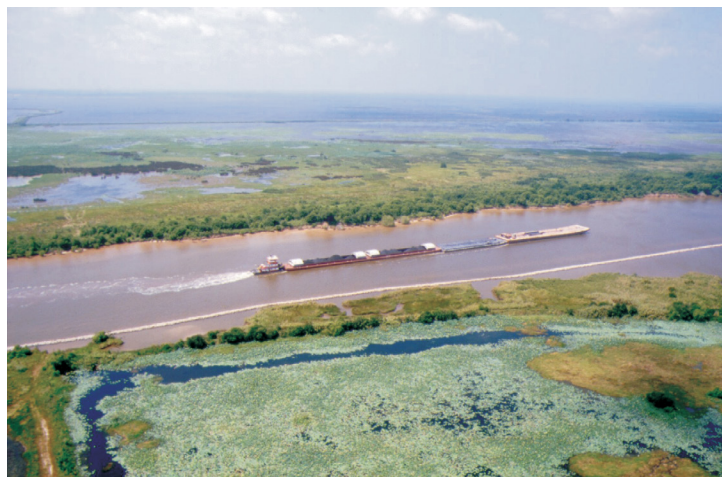
Rock riprap provides shoreline protection from wave energy produced by shipping vessels on the GIWW.

Pictured above is the GIWW at Clear Marais, with the rock riprap running along the right bank. To the immediate right of the riprap is the sheltered area that was the focus of the planting effort, with the management levee forming a boundary between it and the project area's marsh, which is visible on the far right.