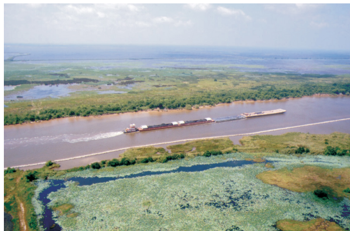
Rock riprap provides shoreline protection from wave energy produced by shipping vessels on the GIWW.

Pictured above is the GIWW at Clear Marais, with the rock riprap running along the right bank. To the immediate right of the riprap is the sheltered area that was the focus of the planting effort, with the management levee forming a boundary between it and the project area's marsh, which is visible on the far right.