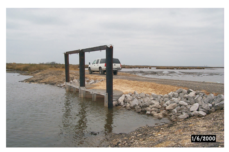
This structure allows the insertion of stop-logs within the openings to regulate water passage. During certain times, such as storms or hurricanes, stop-logs are removed to prevent damage to the structure and adjoining embankments from high water levels.