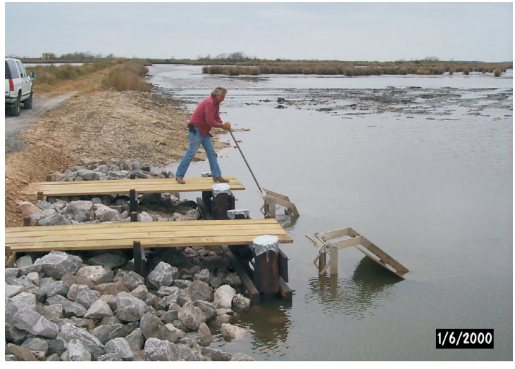
Flap gates on this structure are automatically operated and are opened when salinities allow according to a water management schedule.

This project is on Priority Project List 2.