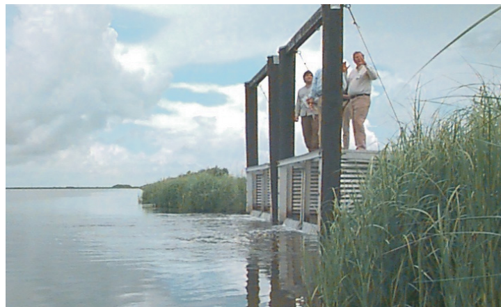
A gate in operation. A healthy stand of cordgrass protects the gate's flanks.

This project is on Priority Project List 2.