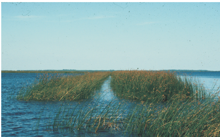
California bulrush plantings after prolonged exposure to elevated salinity levels.

In June 1994, 4,750 California bulrush ( Schoenoplectus californicus ) plants were installed along 11,875 linear feet of marsh shoreline to protect against wave erosion.