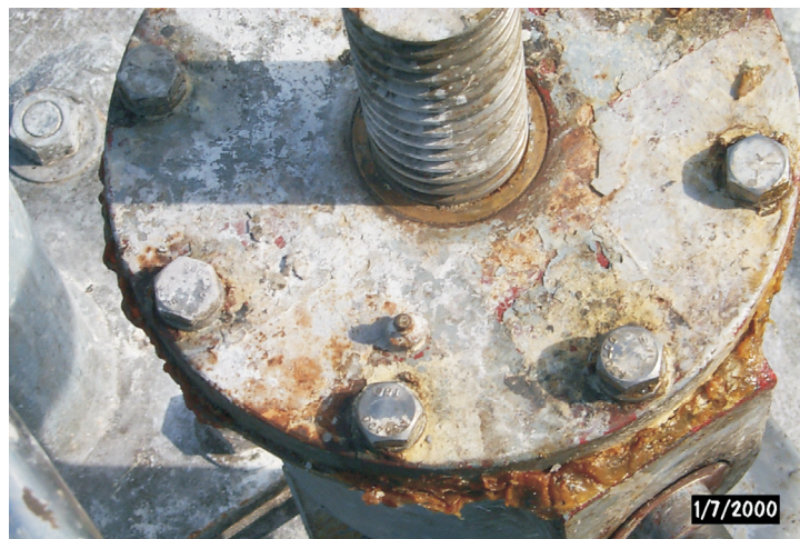
The salty environment of the project area leads to severe corrosion of unprotected pipes, fittings, and valves. This corrosion can eventually leave the water control structures inoperable.