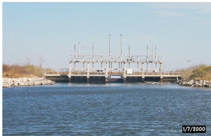
Structures such as this one help regulate the amount of salt water that enters the marsh, improving the health of wetland vegetation.

This project is on Priority Project List 3.