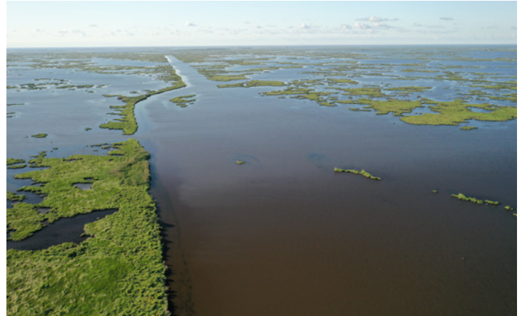
Areas of open water and degraded marsh in the Breton Basin near Yscloskey Marsh Creation Project site.

Sediments will be hydraulically dredged from Lake Borgne and pumped via pipeline to create/nourish approximately 365 acres of marsh. Full containment would be utilized. Containment dikes will be gapped at the end of construction or no later than three years post construction. Dewatering and compaction of dredged sediments should produce elevations conducive to the establishment of emergent marsh and within the intertidal range.