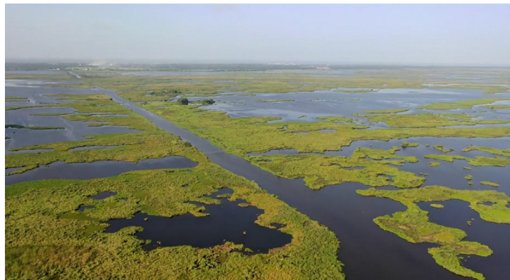
Aerial photo of degraded marsh in the Phoenix Marsh Creation - West Increment project area.

The primary goal of the project is to restore marsh habitat in the open water areas between River aux Chênes and Bayou Garelle through the placement of dredged material via hydraulic dredging. The project would create continuity with the Phoenix Marsh Creation–East Increment Project (BS-42) and would work synergistically with the Breton Landbridge Marsh Creation (West) Project (BS-38). Both projects are located to the east and along the alignment of the Breton Sound Basin Landbridge. The specific goal is to hydraulically dredge riverine sediments from the Mississippi River and pump the sediments via pipeline to create 323 acres of marsh and nourish an additional 88 acres of marsh. Service goals include restoration/protection of habitat for threatened and endangered species and other at-risk species. This project would restore habitat potentially utilized by the black rail, a threatened species. The project could also benefit other species of concern including the saltmarsh topminnow and seaside sparrow.