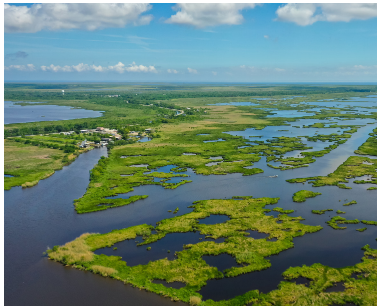
Community of Reggio, LA near degraded marsh and open water areas.

The project goal is to create and nourish approximately 511 acres of marsh east of the Reggio community. This project will create 291 acres and nourish 193 acres of wetlands with sediment hydraulically dredged from a borrow source in Lake Lery. Temporary containment dikes will be constructed and gapped within three years of construction to allow greater tidal exchange and estuarine organism access. Restoration in this area would build the area's defenses against hurricanes and flooding. The project would result in 283 net acres over the 20-year project life.