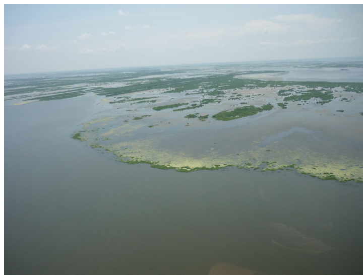
Aerial photo taken looking south at the southern shoreline of Lake Lery with Grand Lake in the background

This is a marsh creation and shoreline restoration project. The marsh creation aspect of the project will have a hydraulic dredge extract material from the Lake Lery water bottom and pump that material into contained marsh creation cells located south and west of the southern and western Lake Lery shorelines. This will create and/or nourish approximately 642 acres of intertidal intermediate marsh. The shoreline restoration component of the project will have a barge-mounted dragline excavating material from the bottom of Lake Lery and placing that material along the southern and western shorelines. This restored shoreline will have a 50 foot crown width and be built to a height considered high intertidal marsh.