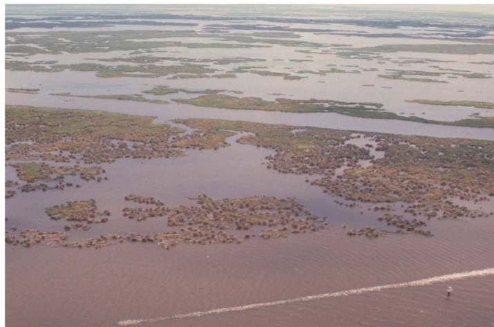
Marshes in the BS-11 project area.

The terraces were planted with seashore paspalum ( Paspalum vaginatum ) and smooth cordgrass ( Spartina alterniflora ).