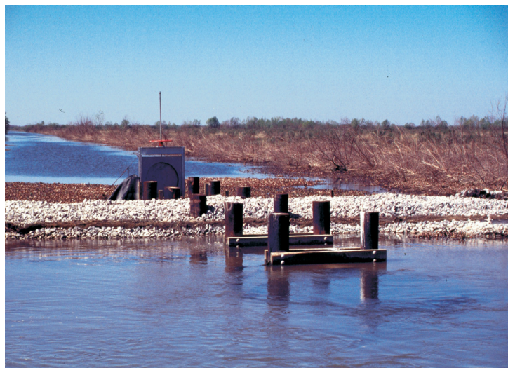
Water control structures installed through existing earthen closures provide fresh water and nutrient access into previously isolated areas.

Since 1956, approximately 3,400 acres of marsh have been lost and converted to open water in the basin. The majority of fresh water from the Caernarvon Diversion structure exits the project area through larger, natural and manmade channels so that benefits to the adjacent marshes are not maximized. These conditions are exaggerated during periods of low diversion discharges or low water levels. The existing Caernarvon Freshwater Diversion project (funded by the Water Resources Development Act) releases water into Big Mar and Bayou Mandeville but does not force water over the marsh.