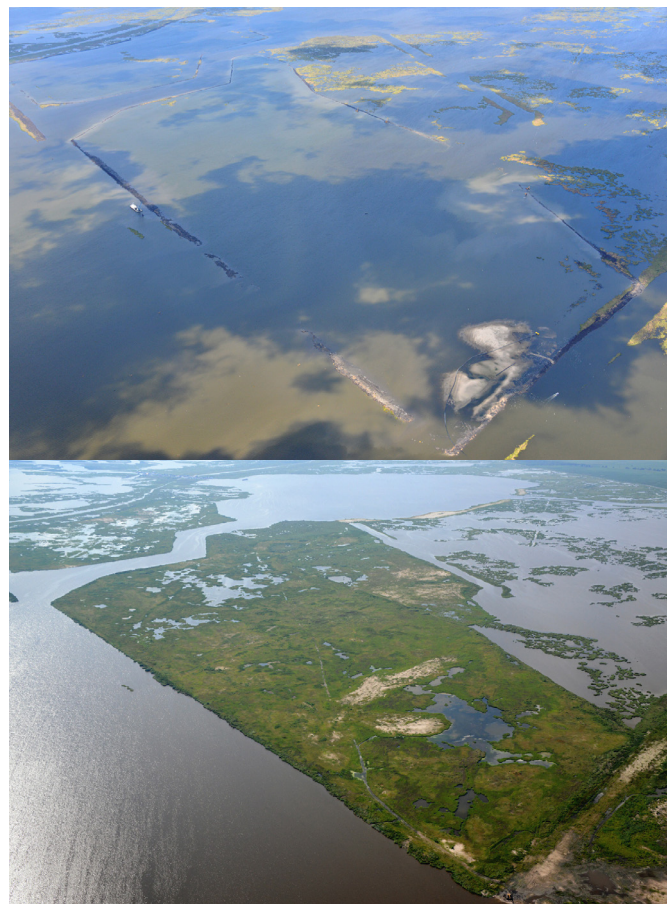
Before and after images show the newly created marsh.

Funding from the Louisiana Oil Spill Coordinator's Office, the Louisiana Department of Natural Resources - Office of Coastal Management, and Deepwater Horizon Early Restoration allowed construction of an additional 215 acres of marsh. Terraces were removed from the CWPPRA project to provide an area for marsh creation with Deepwater Horizon Early Restoration funding.