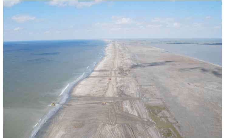
This photo shows the island after construction but before establishment of native beach, dune, and marsh vegetation.

This project is listed on Priority Project List 11.