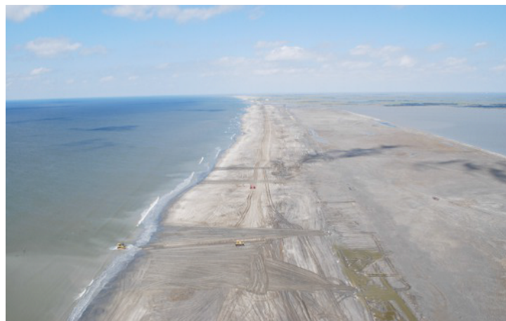
This photo shows the island after construction but before establishment of native beach, dune, and marsh vegetation.

This project is listed on Priority Project List 11.