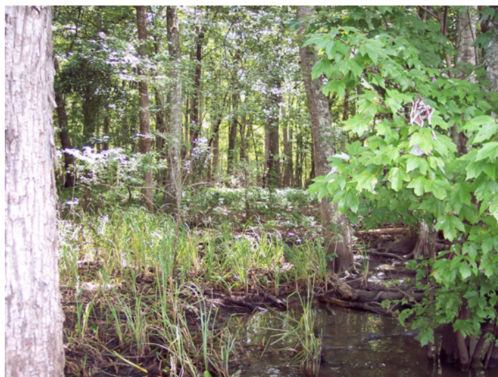
Recent photo at the edge of the swamp. The impoundment has led to a negative effect on cypress and tupelo trees and encouraged the growth of herbaceous marsh plants.

Coastal Protection and Restoration Authority Baton Rouge, LA (225) 342-4736