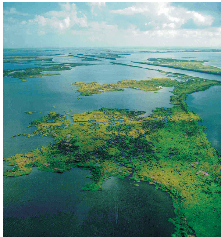
Looking south towards the Barataria Bay Waterway near Bayou St. Denis.

The project would involve installation of gated box culverts on the west bank of the Mississippi River in the vicinity of Myrtle Grove; dedicated dredging from the Mississippi River to create marsh in the vicinity of Bayou Dupont, the Barataria Bay Waterway, and the Wilkinson Canal; or a combination of these actions. Supporting features might include a conveyance channel with parallel mainline flood control levees and an outflow channel with guide levees. Dredging to create adequate outfall in the headwaters of Bayou Dupont and construction of a pump station may be required.