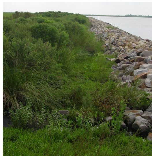
This photo illustrates the rock revetment protecting the vegetative shoreline.

This project was selected for Phase I (engineering and design) funding at the January 2002 Breaux Act Task Force meeting. Project construction was completed in 2005. It is included as part of Priority Project List 11.