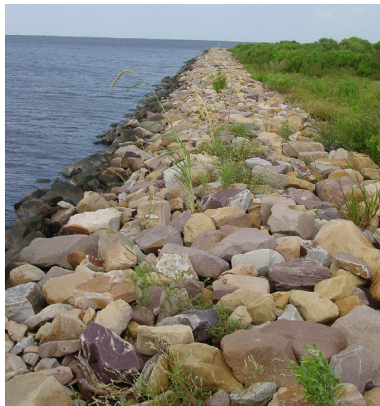
Five years after construction, the constructed rock revetment has proven to be very effective at eliminating shoreline erosion.