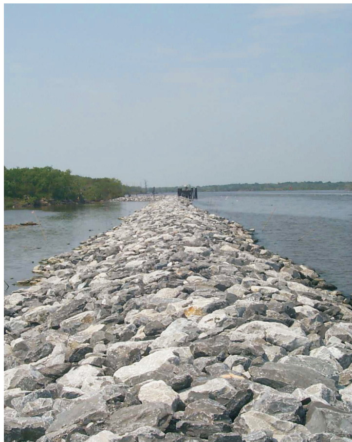
Protection was provided to a total of 41,000 feet of shoreline in order to preserve the effectiveness of these areas in preventing marsh loss.

This project is on Priority Project List 9.